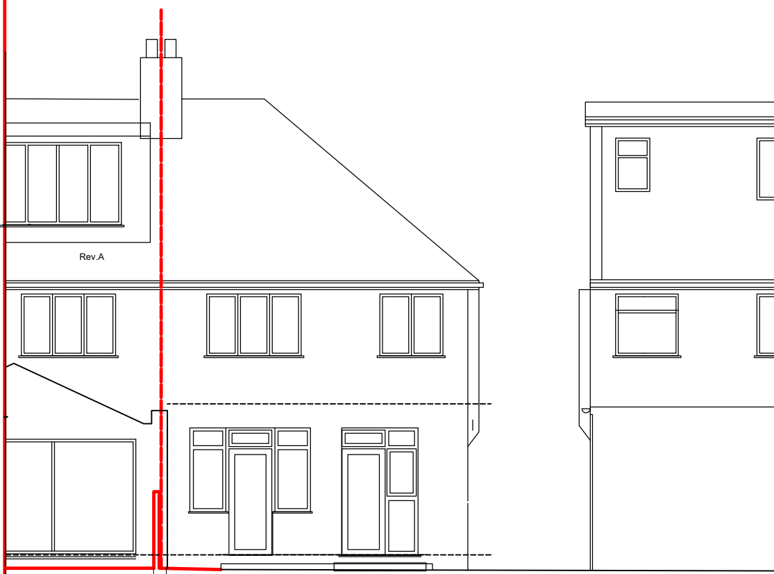
REAR ELEVATION: WEST.