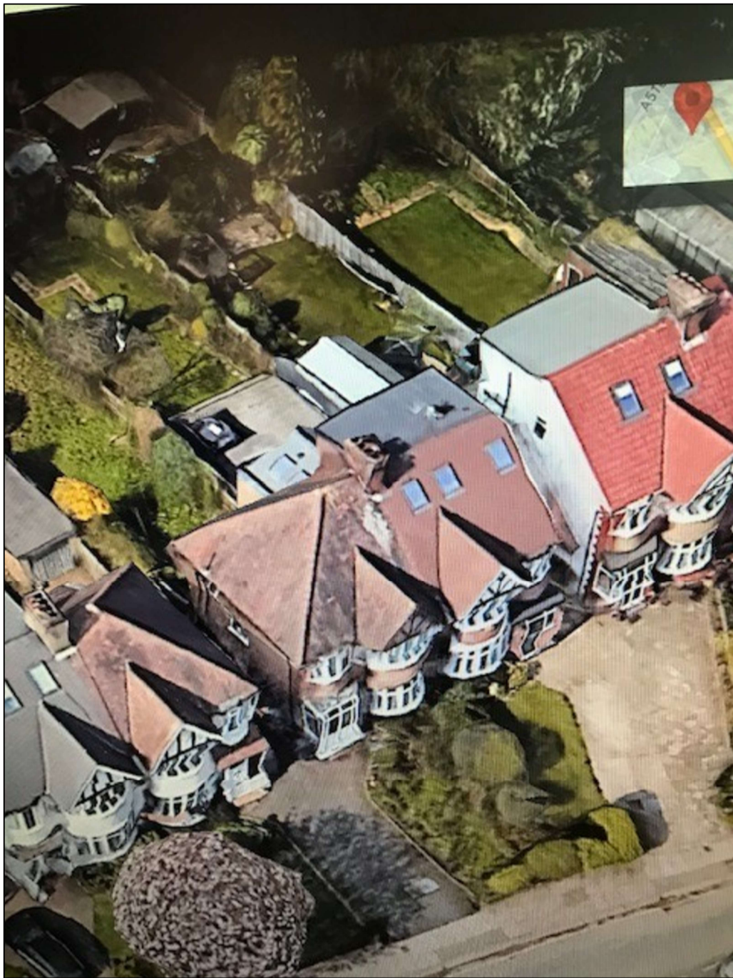
◀ AERIAL VIEW : LOOKING NORTH WEST.