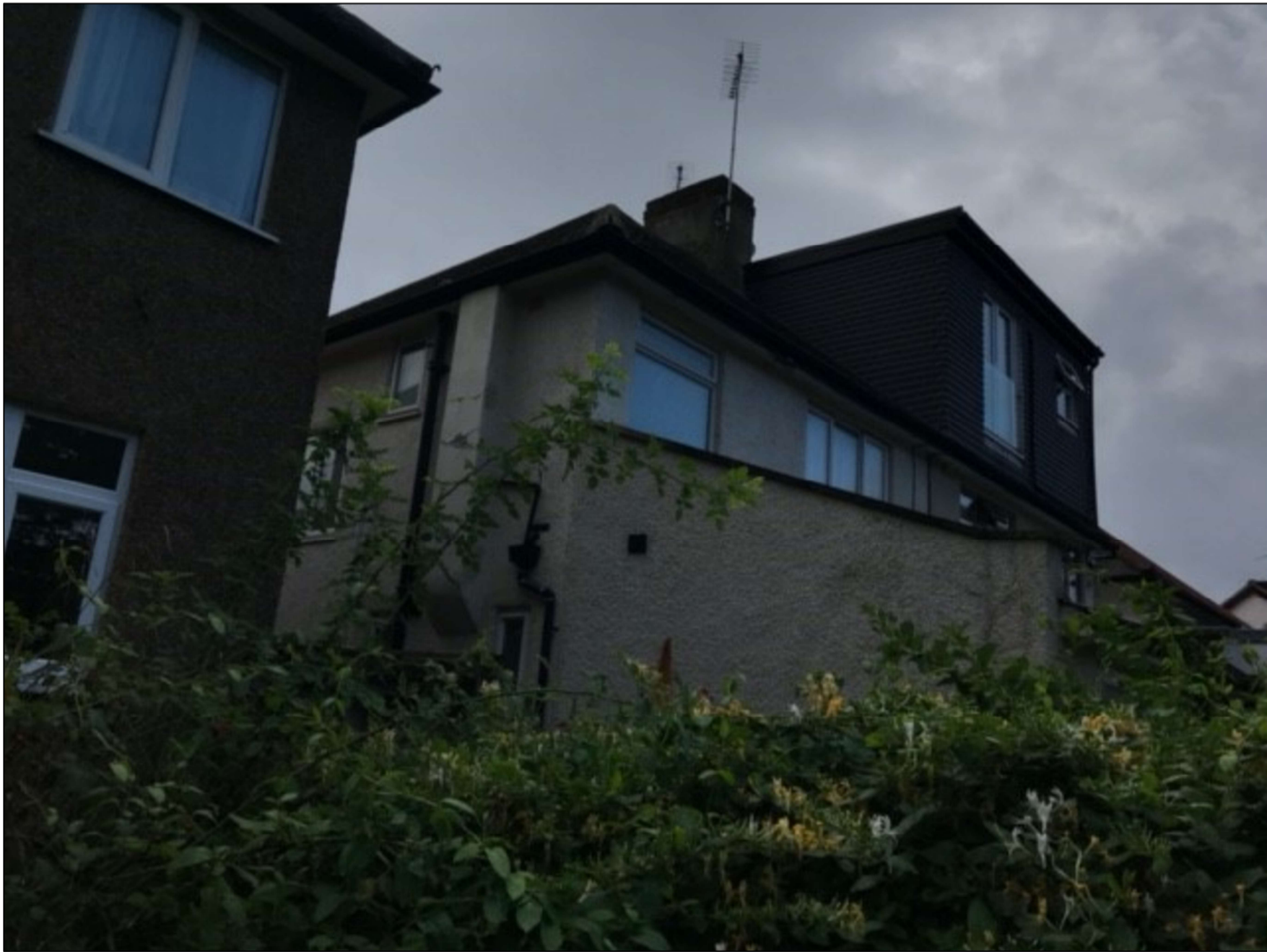
REAR VIEW OF No 7 MAXWELTON CLOSE (Looking South East).