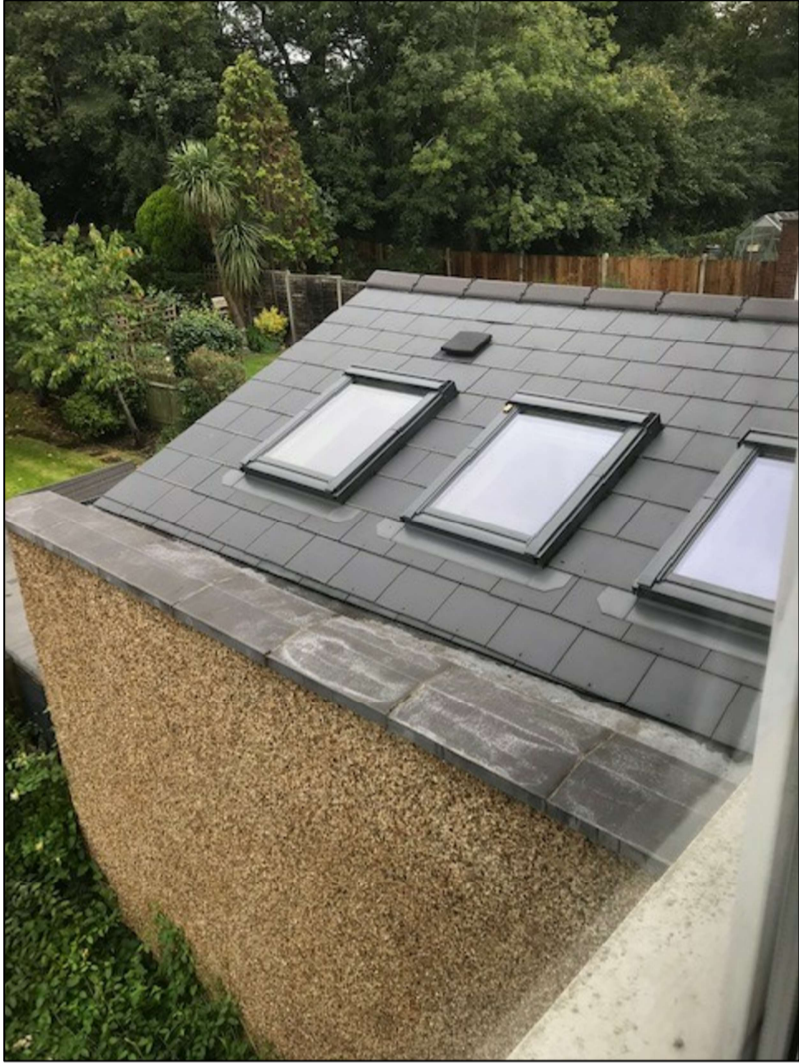
◀ REAR VIEW OF No 11 MAXWELTON CLOSE (showing ground floor extension).