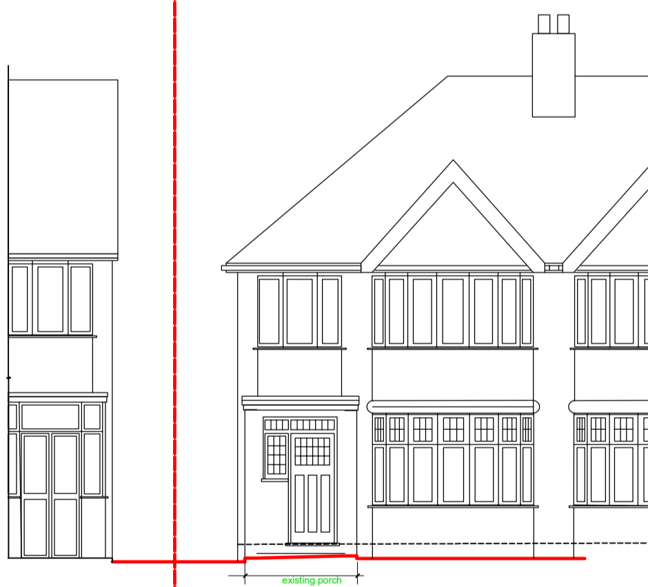
FRONT ELEVATION: EAST.

APPLICATION: PRIOR APPROVAL NOT REQUIRED. ELEVATIONS: PROPOSED.