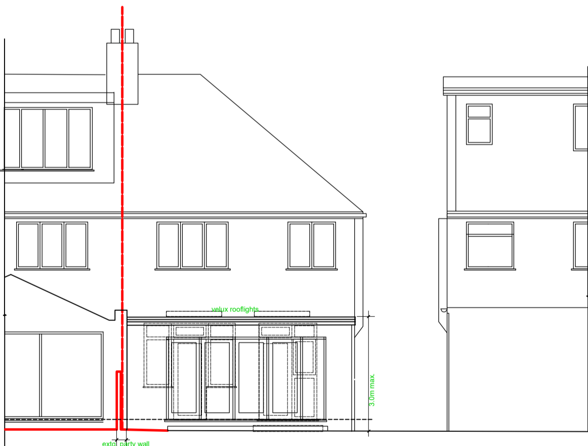
REAR ELEVATION: WEST.