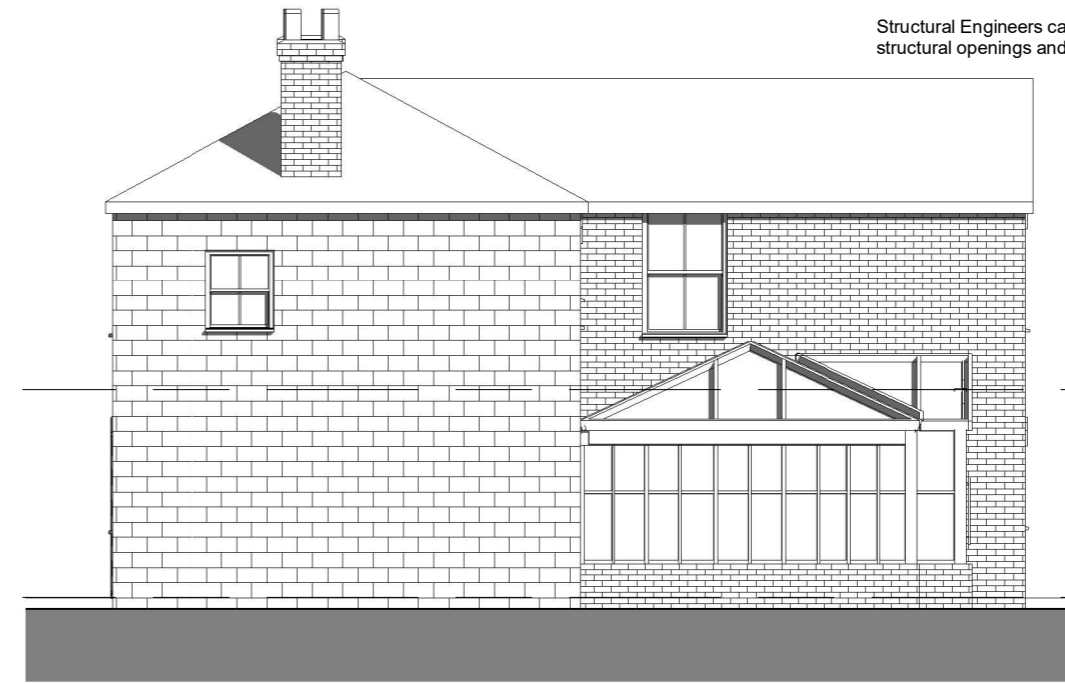
East Elevation 1 : 100