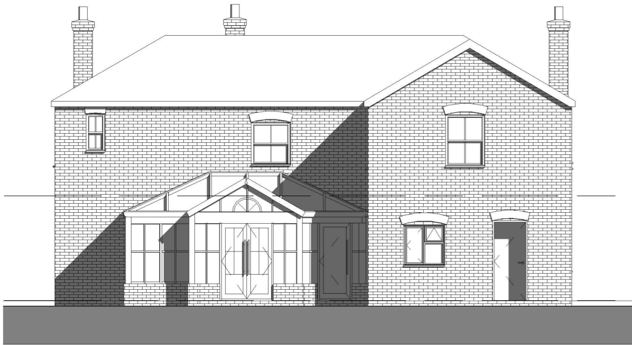
Rear (North) Elevation 1 : 100