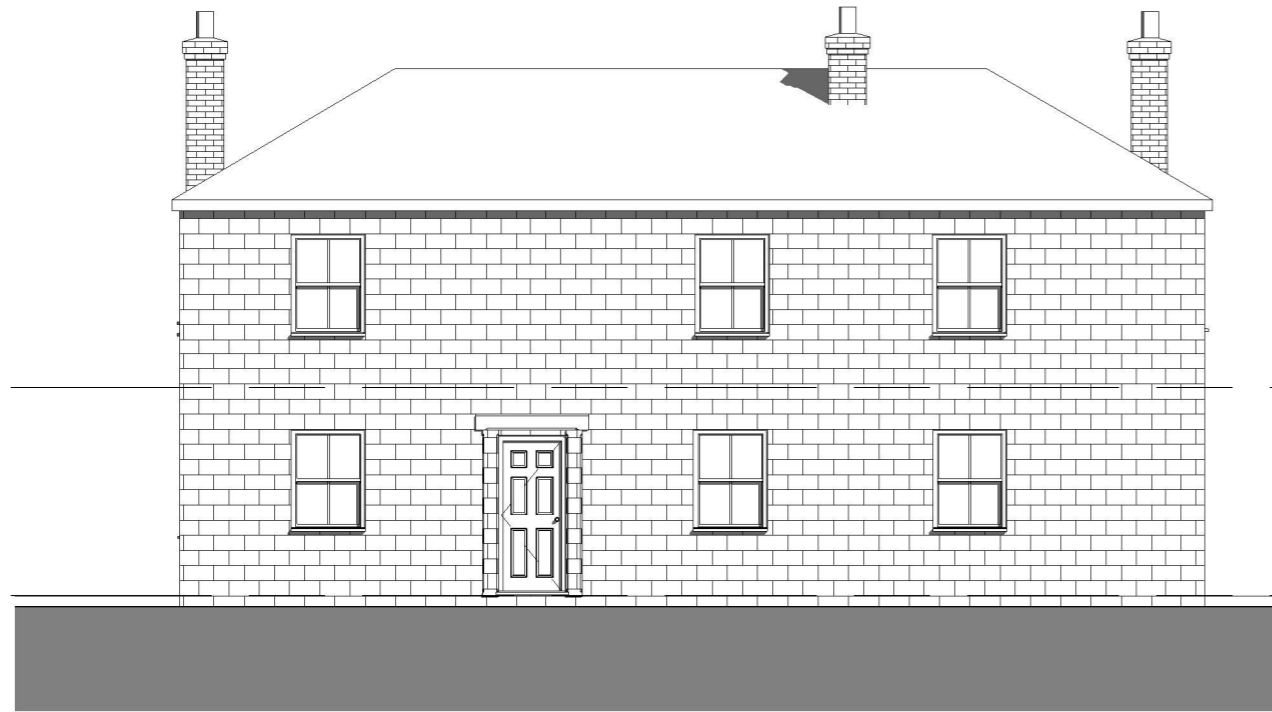
Front (South) Elevation 1 : 100

Structural Engineers calculations will be required for all new structural openings and alterations.