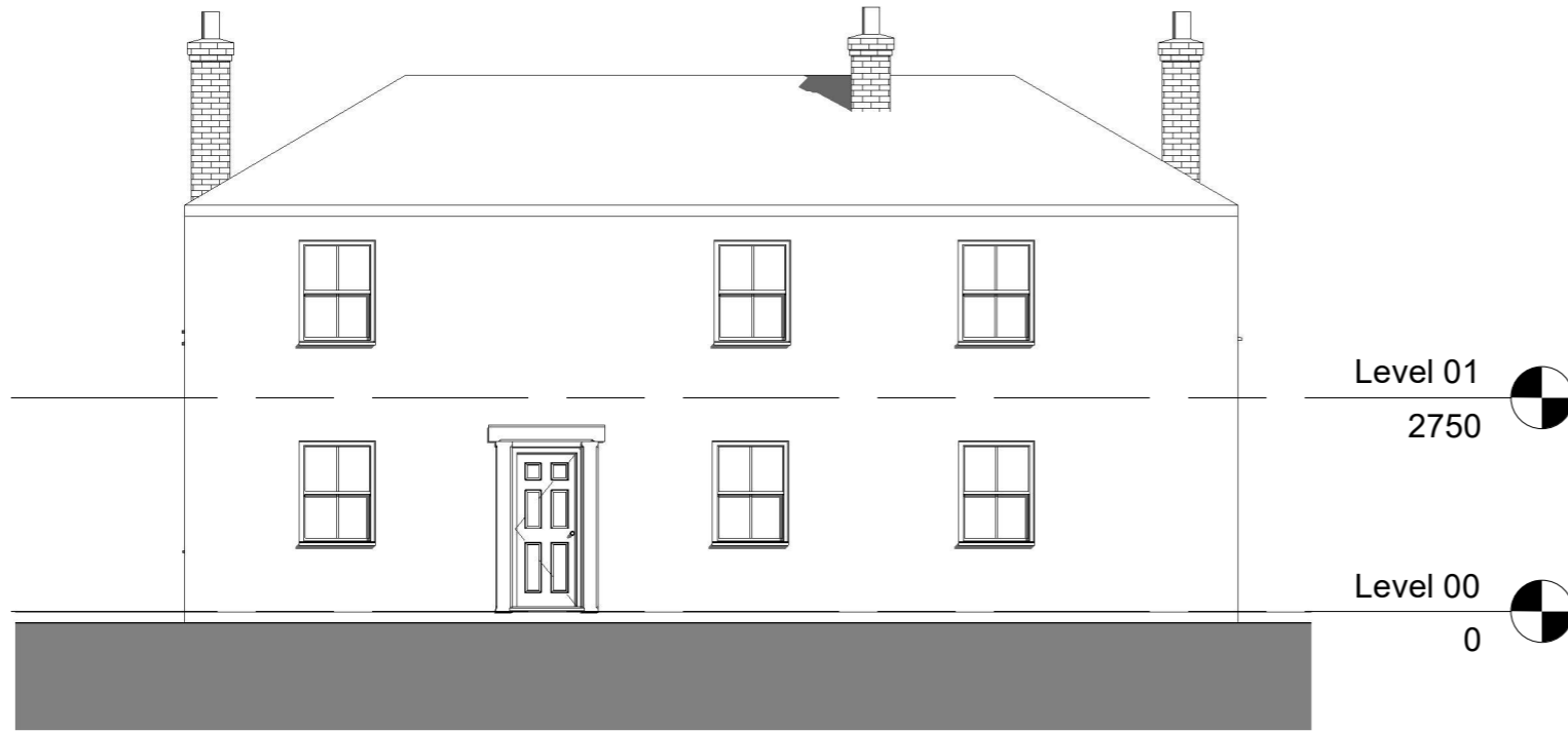
Front (South) Elevation 1 : 100

Structural Engineers calculations will be required for all new structural openings and alterations.