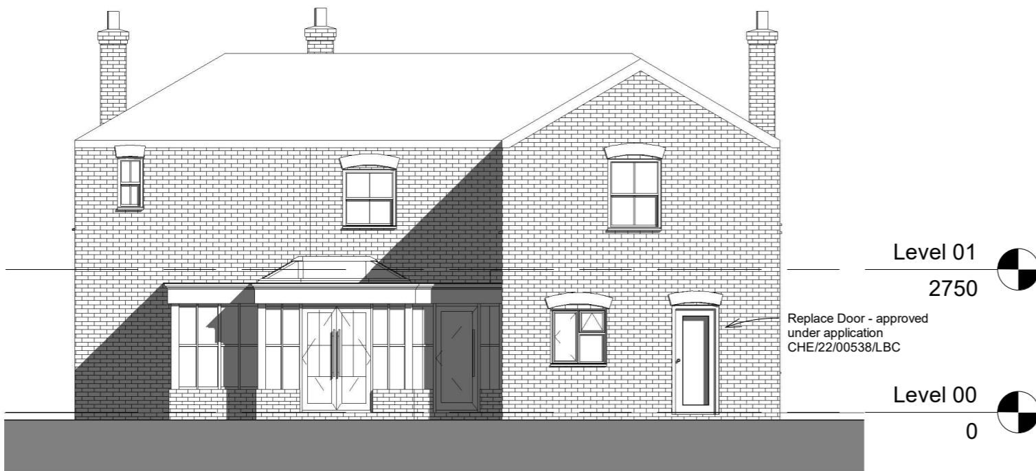
Rear (North) Elevation 1 : 100