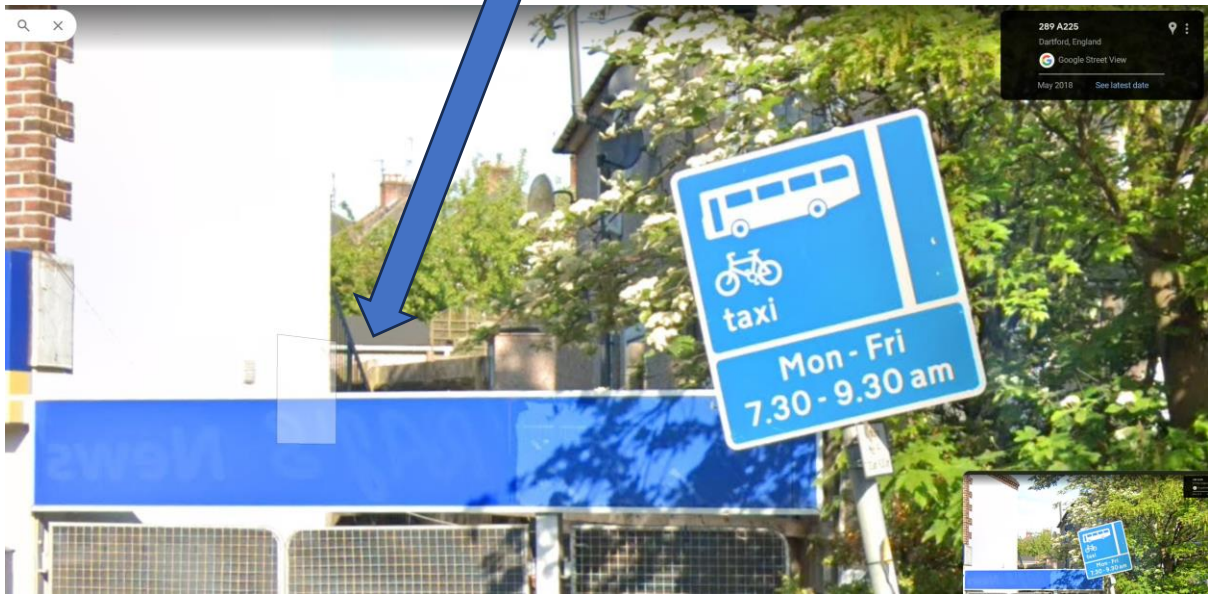
May 2018. Google Streetview screenshot zoomed in