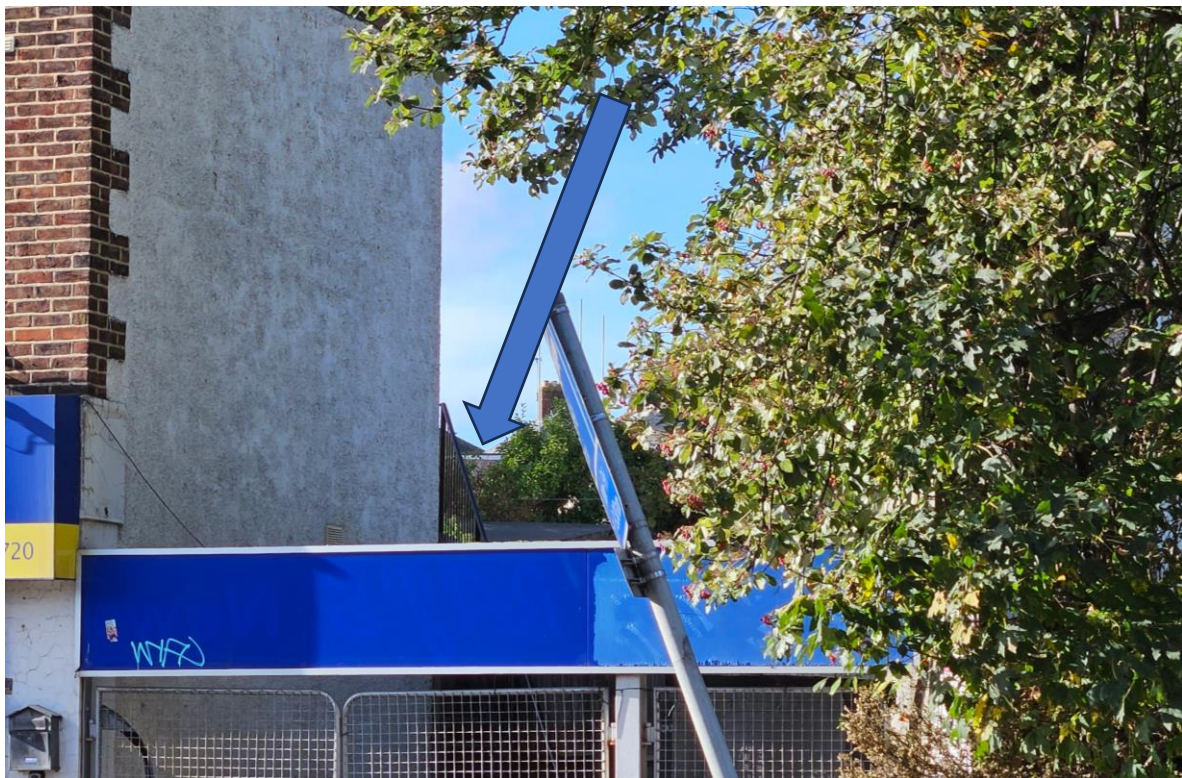
Current photograph 27.10.23 of the staircase

Both images match. It is proved that the staircase has been present since at least May 2018, which is a period exceeding 4 years.