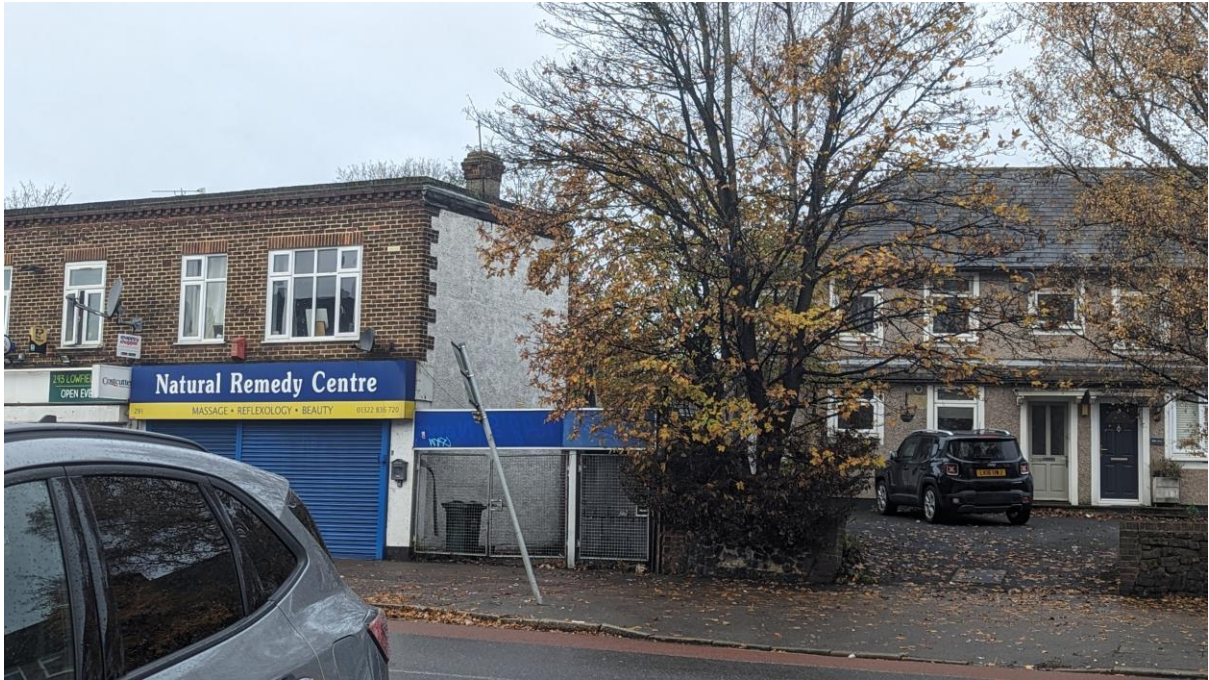
Current photograph of the staircase and showing the tree providing screening – front elevation