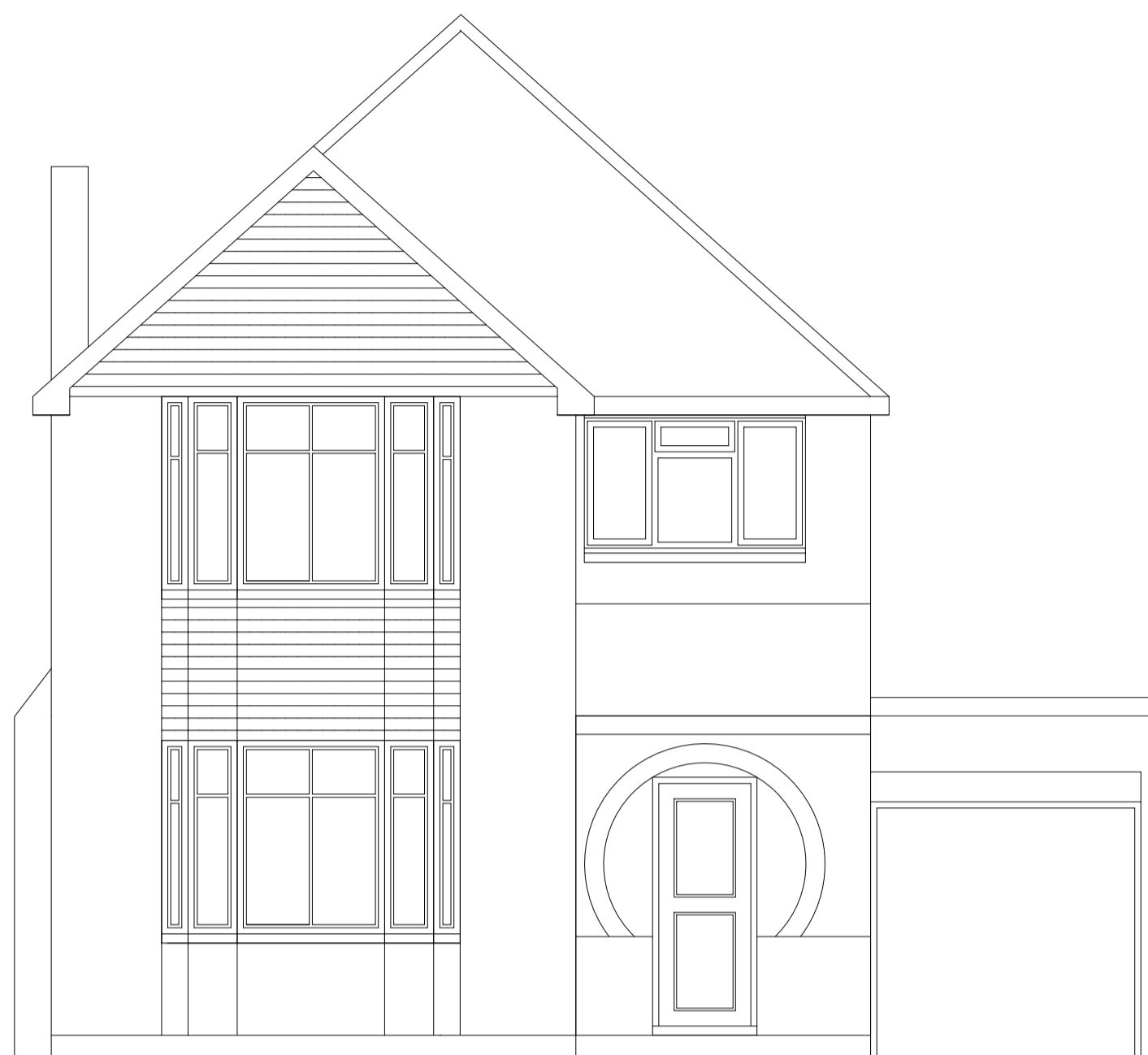
FRONT (EAST) ELEVATION