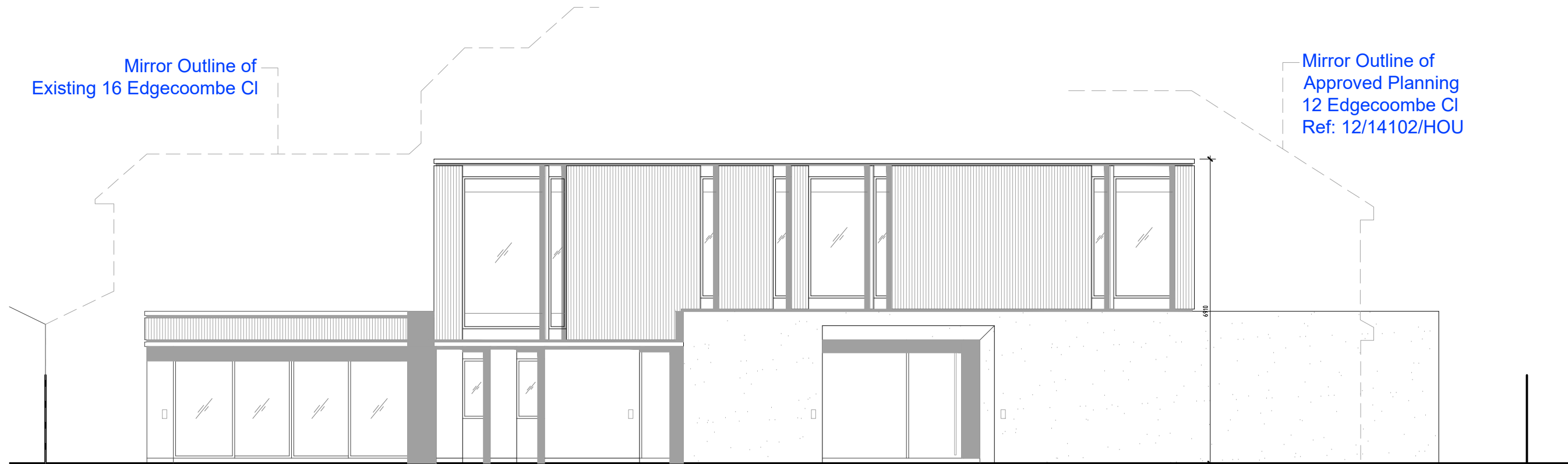
14 Edgecombe Close (Application Boundary)