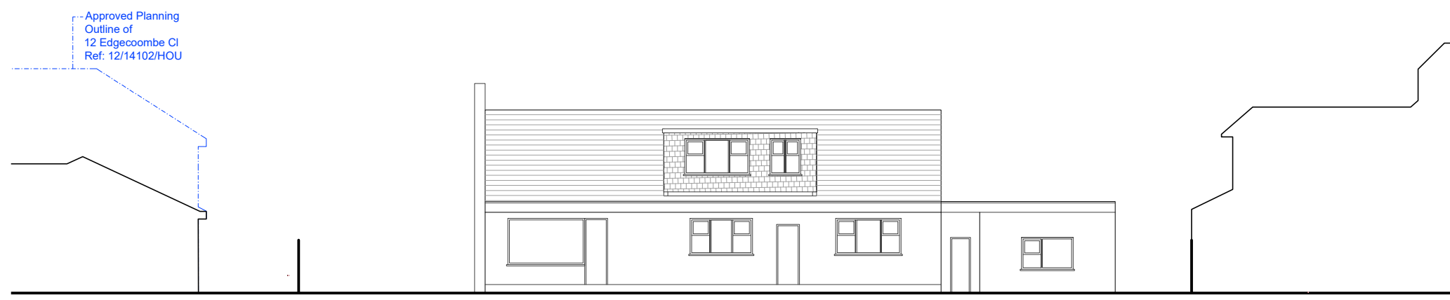
Existing Rear Elevation 12 Edgecombe Close | 14 Edgecombe Close (Application Boundary) | 16 Edgecombe Close