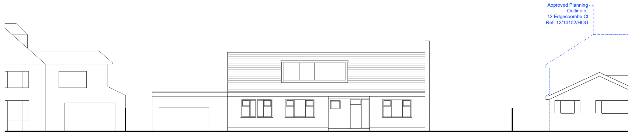
Existing Front Elevation 16 Edgecombe Close | 14 Edgecombe Close (Application Boundary) | 12 Edgecombe Close