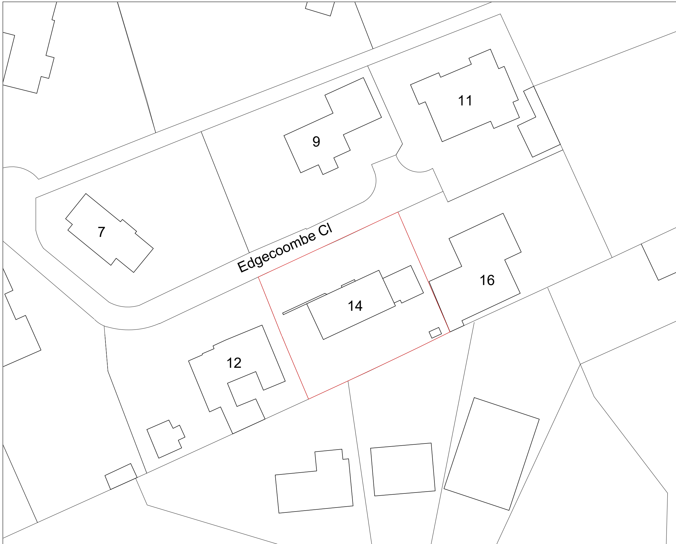
Block Plan 1/500