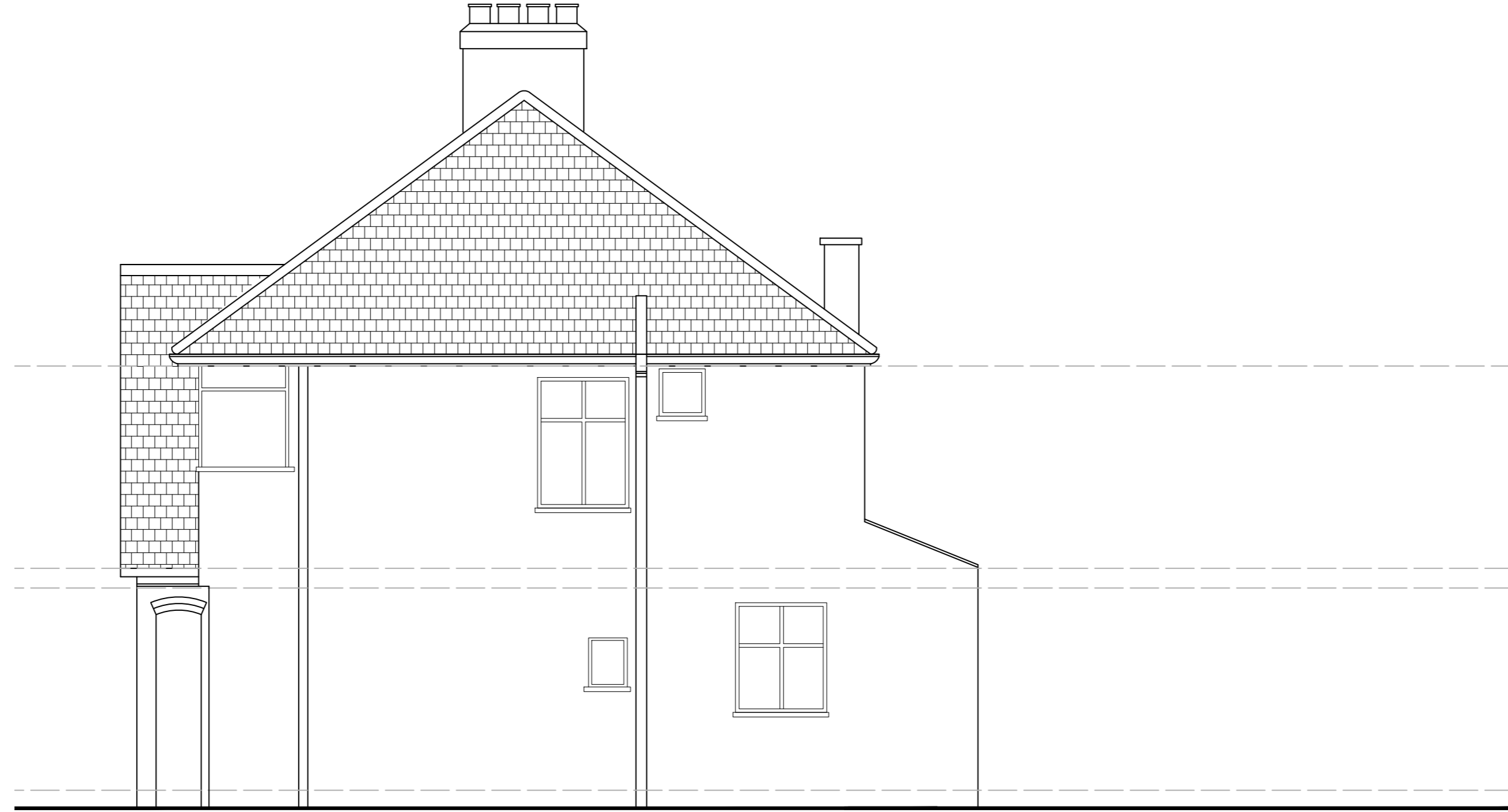
EXISTING SIDE ELEVATION SCALE 1:50@ A2

Drawings are subject to building control approval