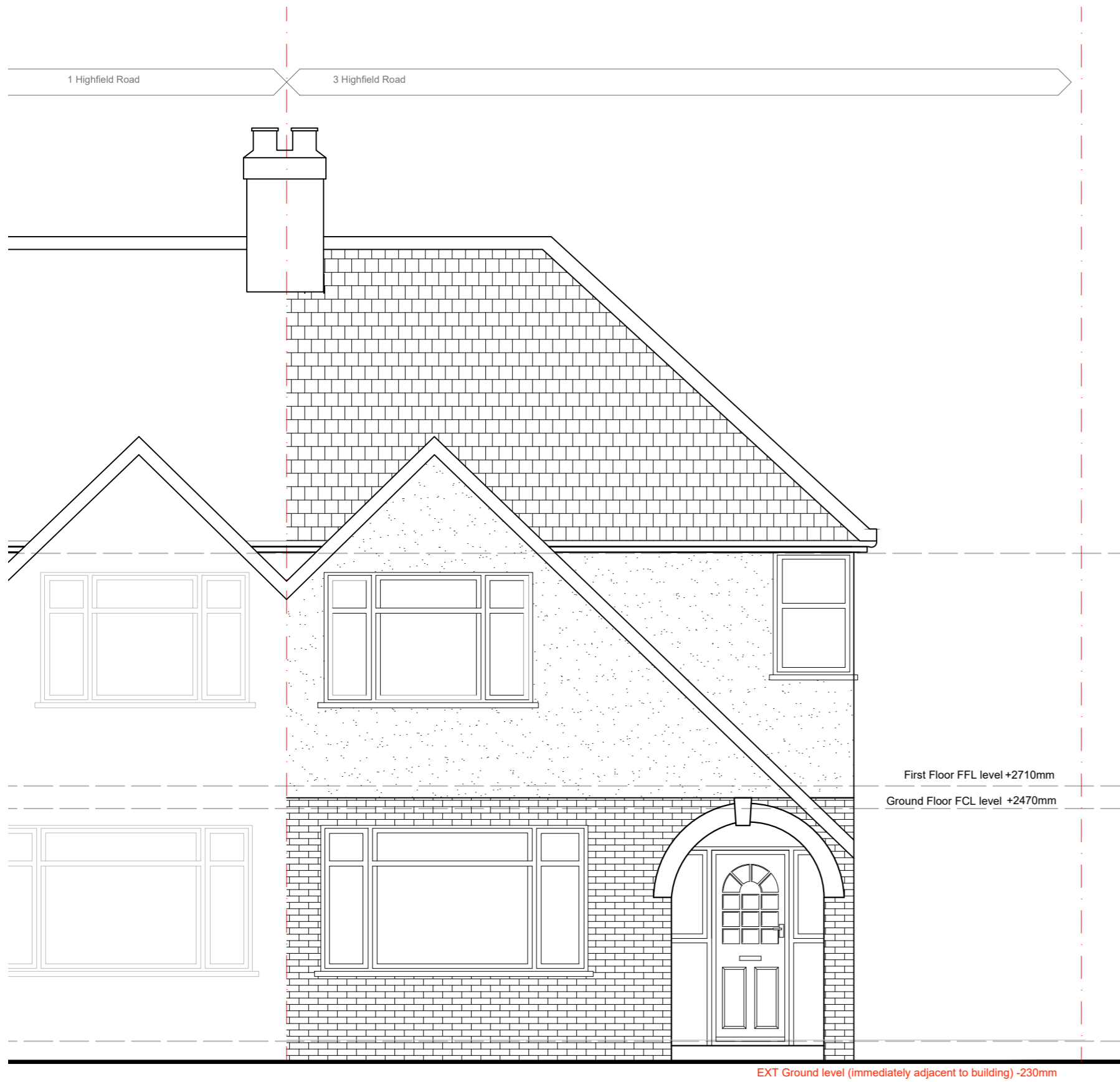
EXISTING FRONT ELEVATION SCALE 1:50@ A2

All Steels Joists etc to be measured from site, do not measure from drawing or calculations, site dimensions to be taken. NKM Studio will not be held responsible for incorrect materials any mistake should be reported to NKM Studio straight away.