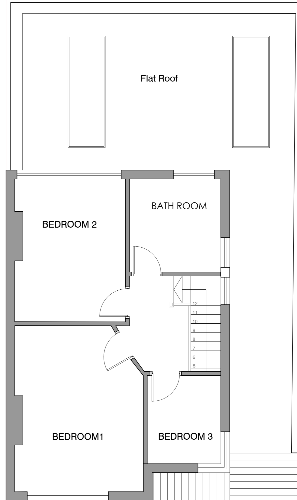
PROPOSED FIRST FLOOR PLAN SCALE 1:50@ A2