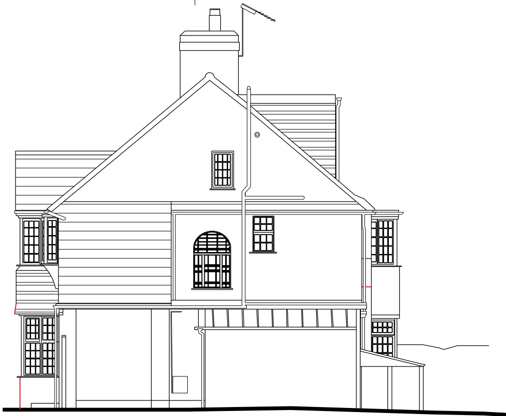
Side Elevation 1