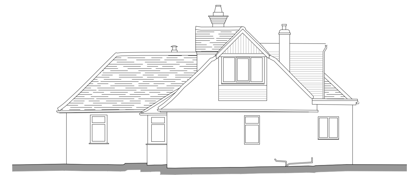
SIDE (NORTH) ELEVATION SCALE 1:100