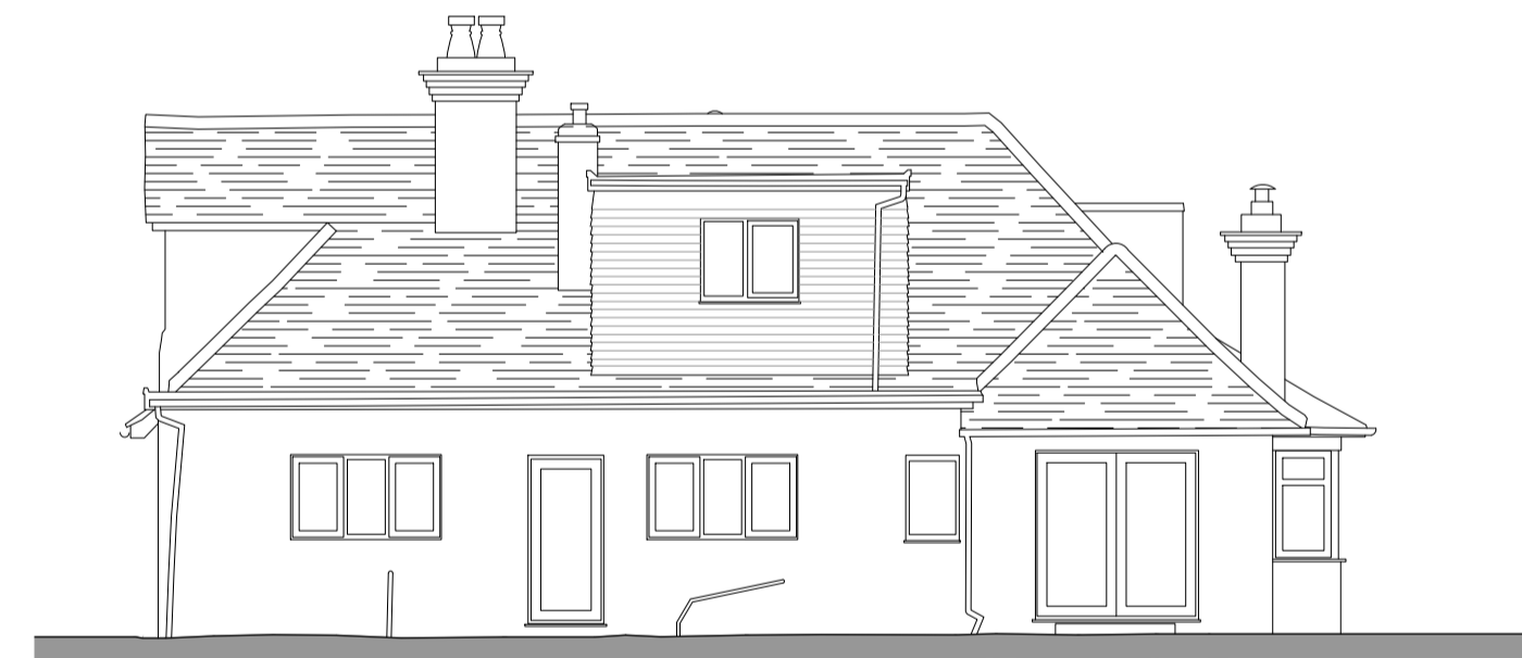
REAR (WEST) ELEVATION SCALE 1:100