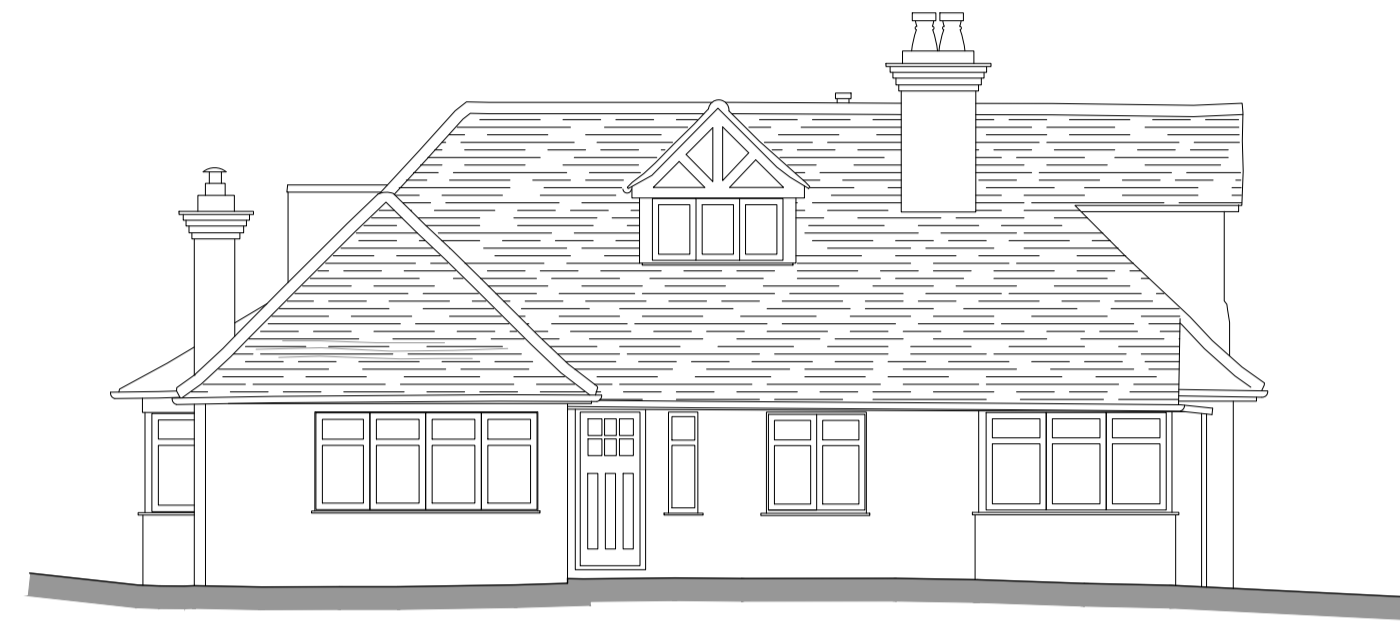
FRONT (EAST) ELEVATION SCALE 1:100