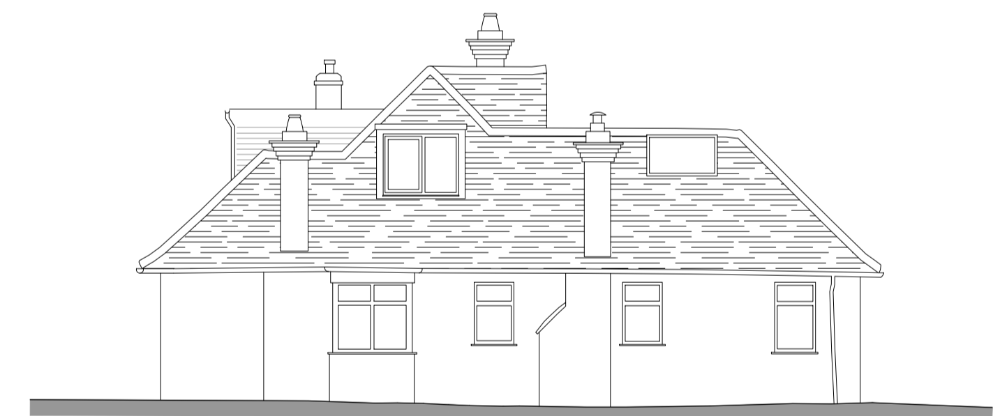
SIDE (SOUTH) ELEVATION SCALE 1:100