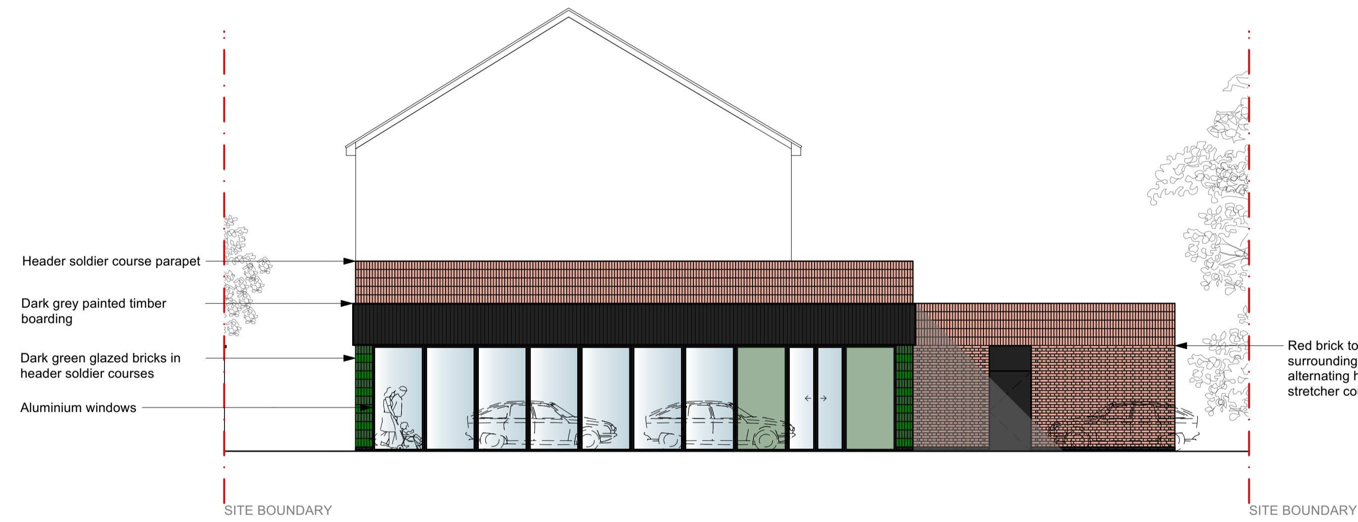
2 South East Elevation Scale: 1:100