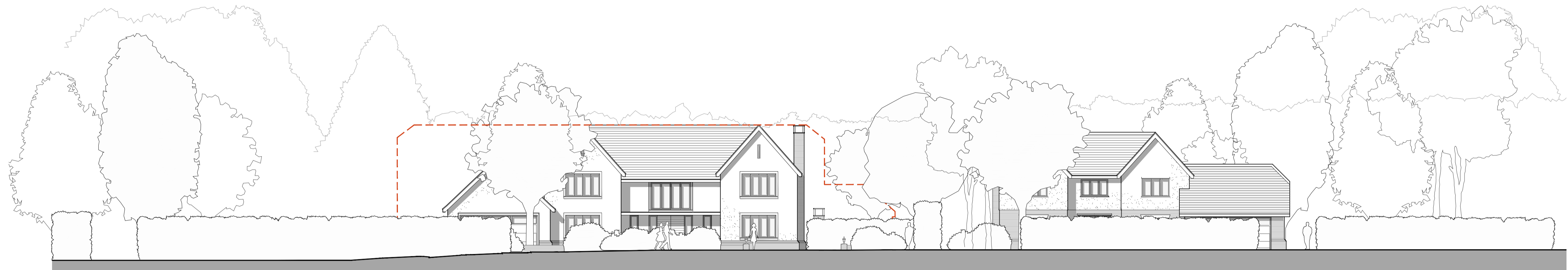
SITE SECTION Proposed | 1:150