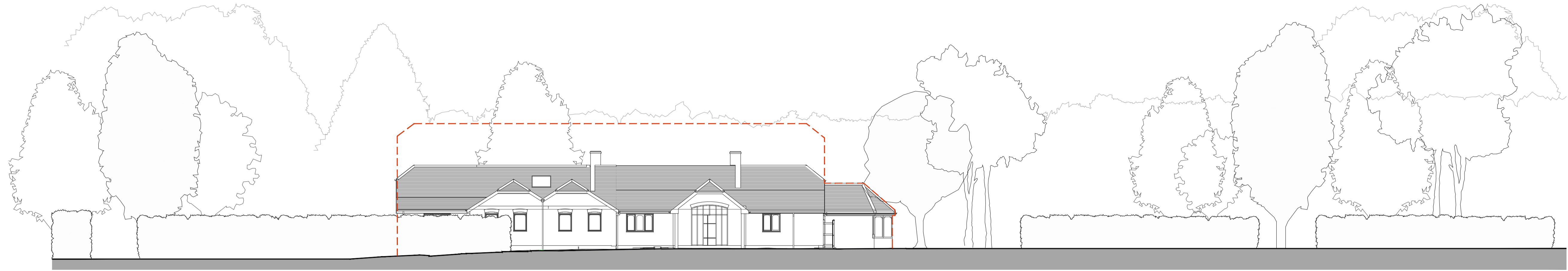
SITE SECTION Existing | 1:150