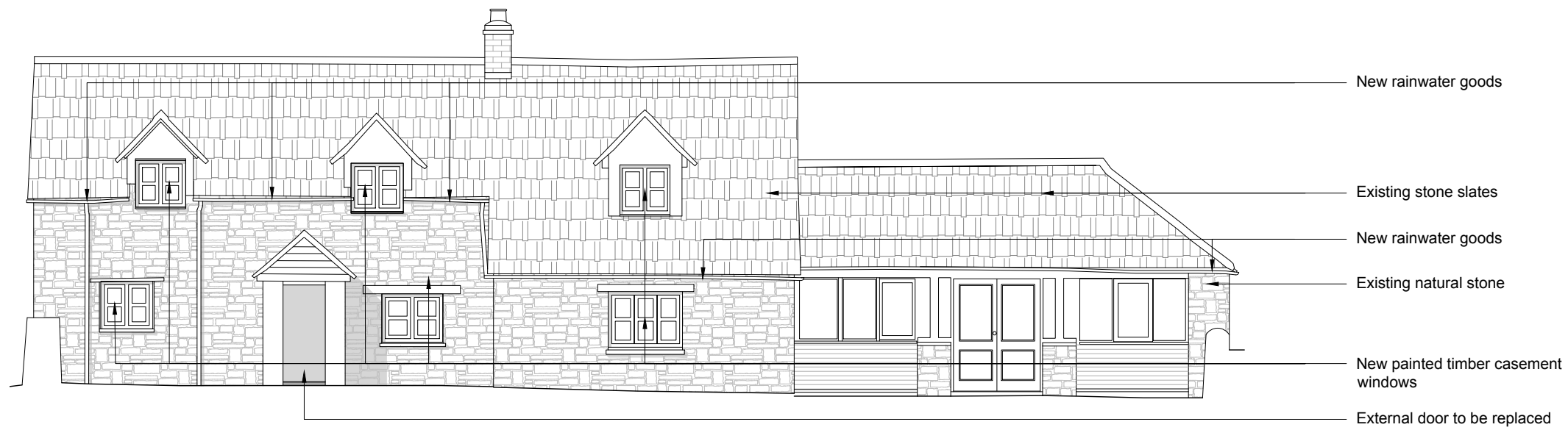
01 South Elevation