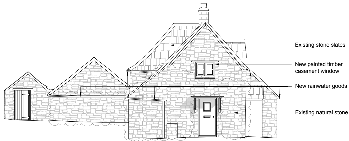
03 West Elevation