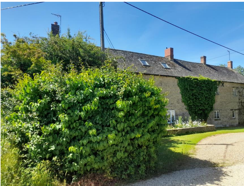
Existing North Elevation