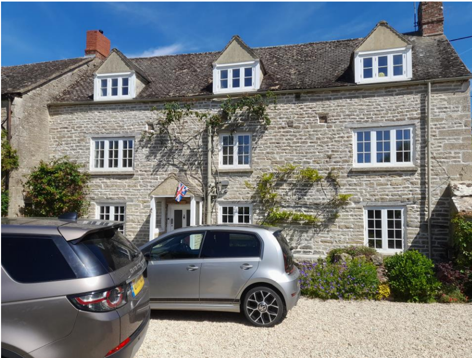
Existing South Elevation