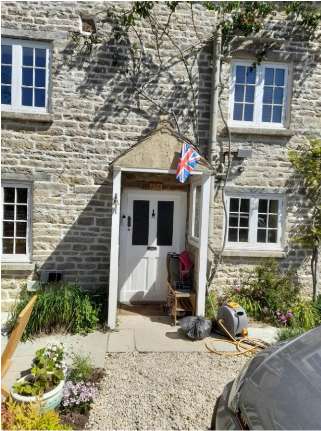
Existing South Elevation