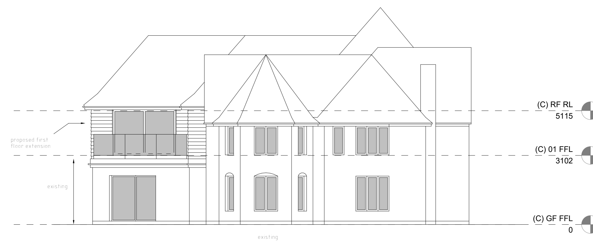
2 (14) ELEVATION B 04001 1:100