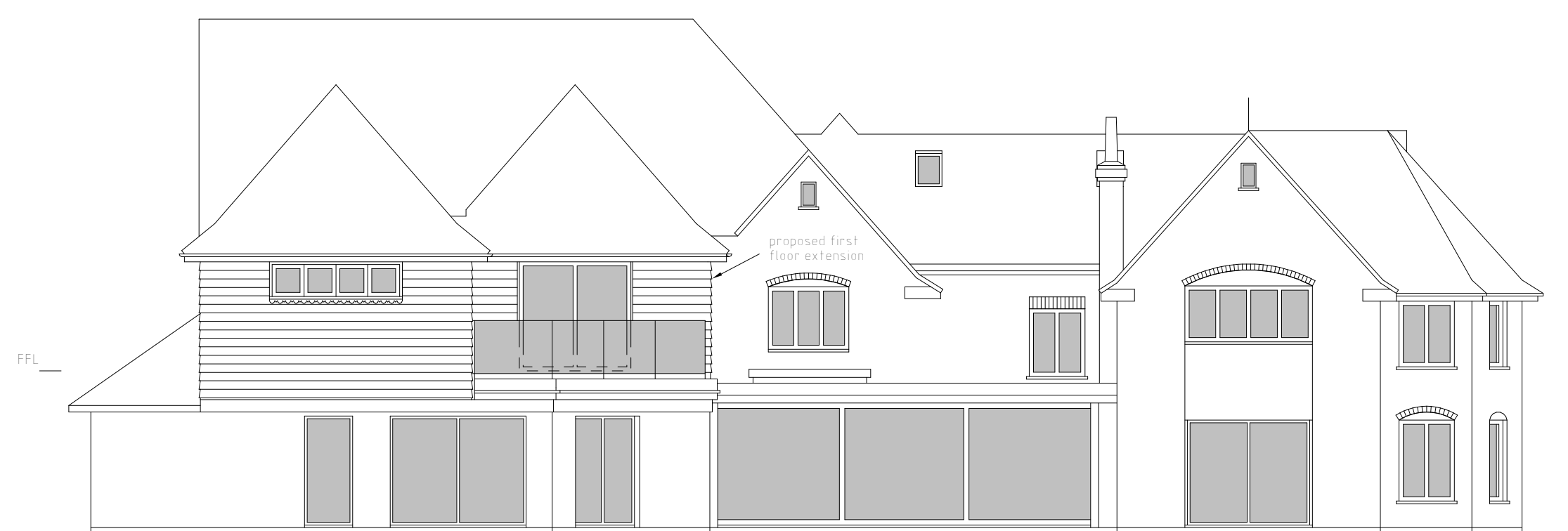
1 (14) ELEVATION A 04001 1:100