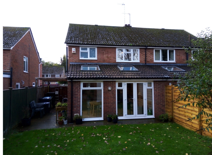
EXISTING REAR VIEW