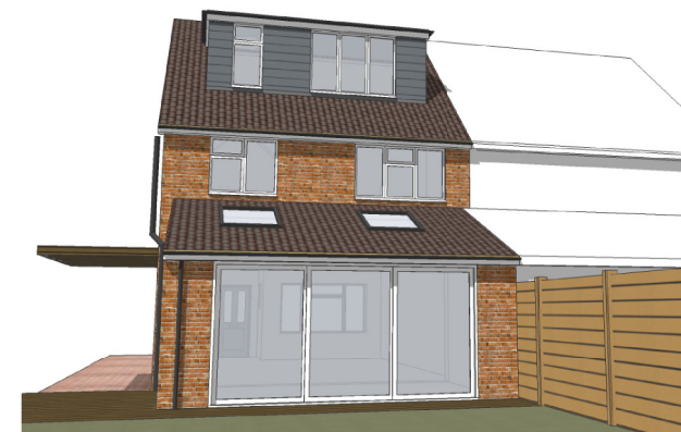
PROPOSED REAR VIEW