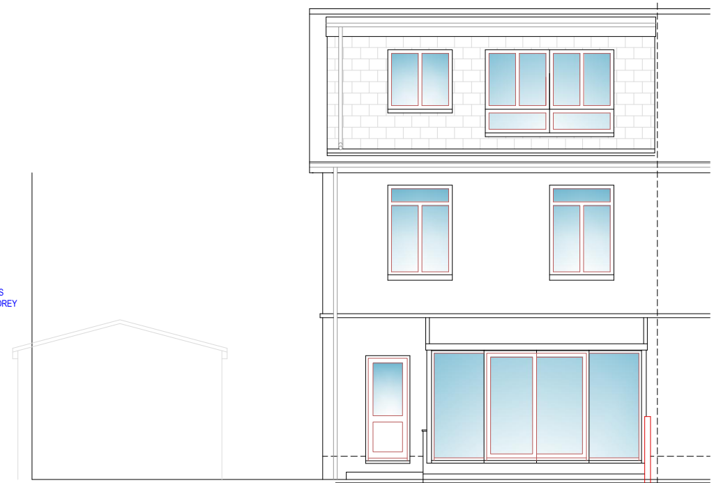
PROPOSED REAR ELEVATION 1:100 @ A3

ROOF TILES TO MATCH EXISTING SINGLE PLY FLAT ROOF - GREY STONE WORK TO MATCH EXISTING BLACK UPVC FASCIAS TO MATCH EXISTING BLACK UPVC RAINWATER GOODS TO MATCH EXISTING WHITE UPVC WINDOWS TO MATCH EXISTING TILE HANGING TO DORMER WALLS