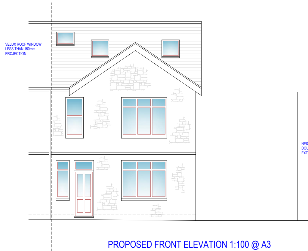
PROPOSED FRONT ELEVATION 1:100 @ A3