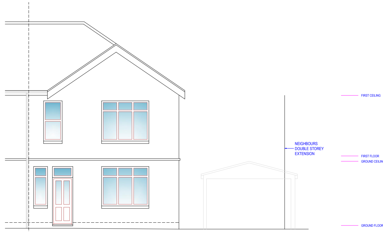
EXISTING FRONT ELEVATION 1:100 @ A3