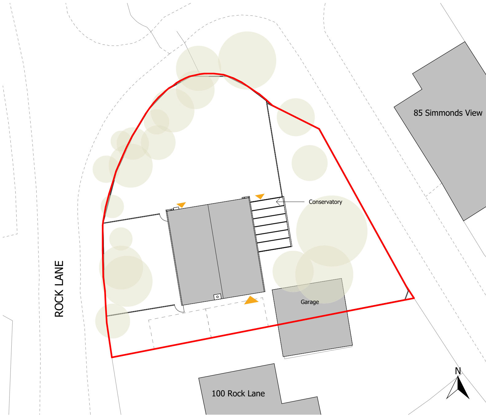
1 02 Site Plan - Existing SCALE 1 : 200