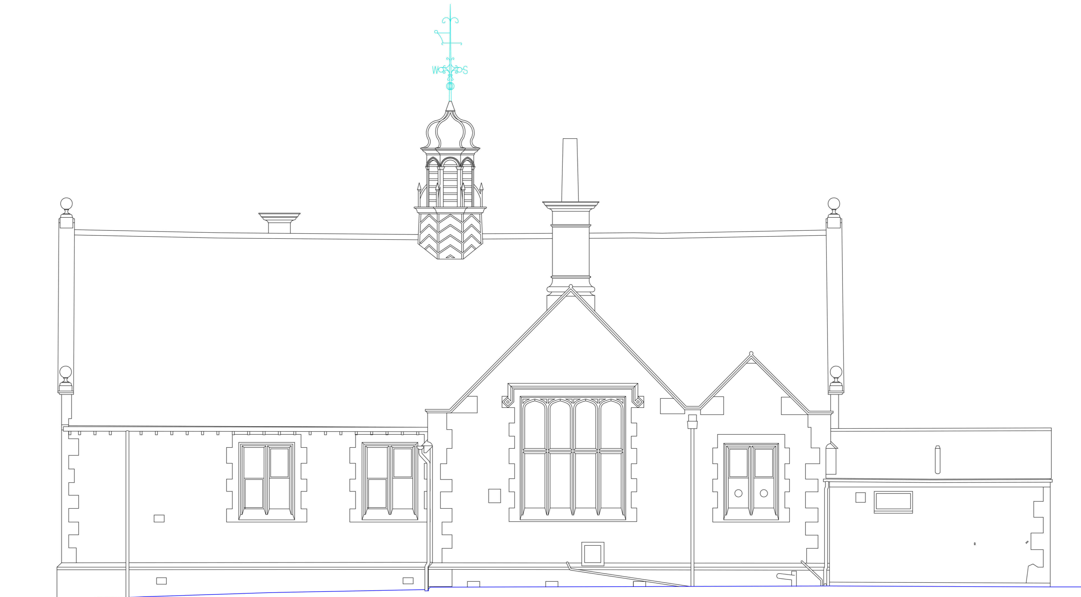
LECKHAMPTON VILLAGE HALL REAR/SOUTH-WEST ELEVATION