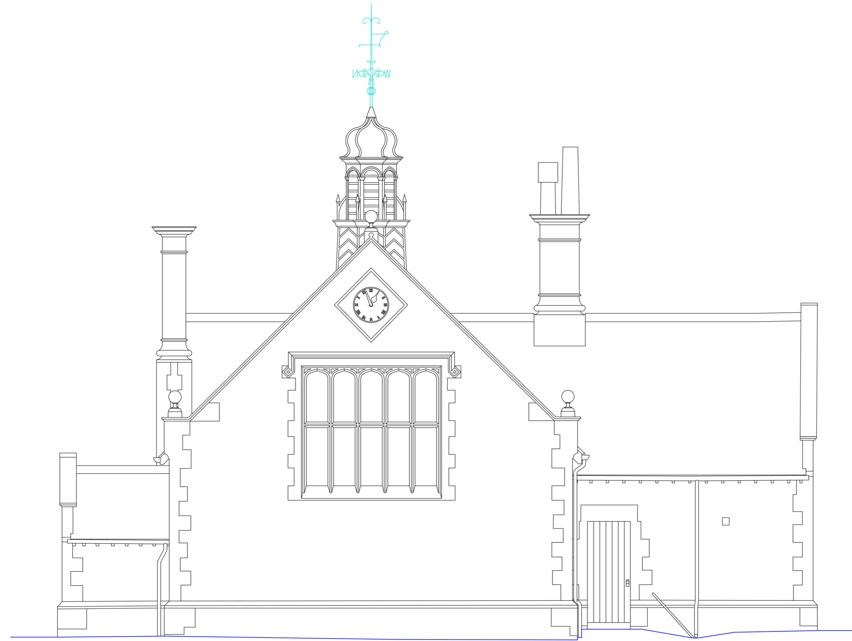
LECKHAMPTON VILLAGE HALL SIDE/NORTH-WEST ELEVATION