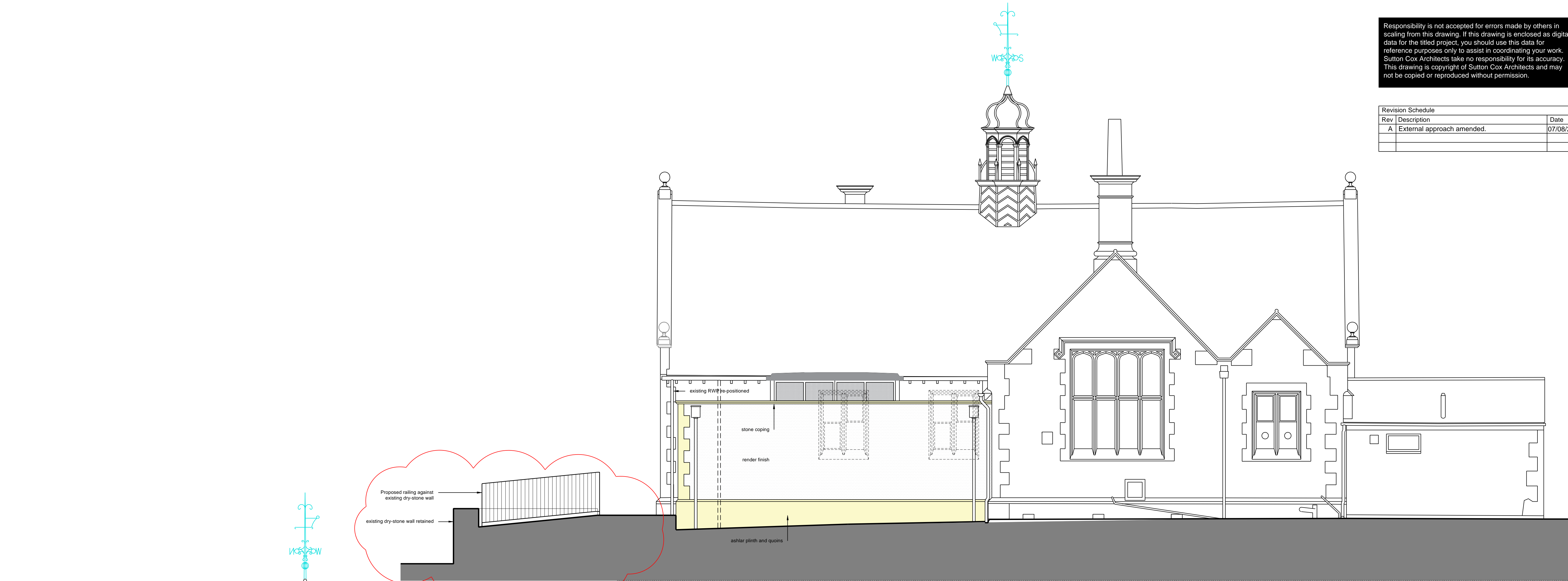
SOUTH WEST ELEVATION FACING NEIGHBOURING PROPERTY