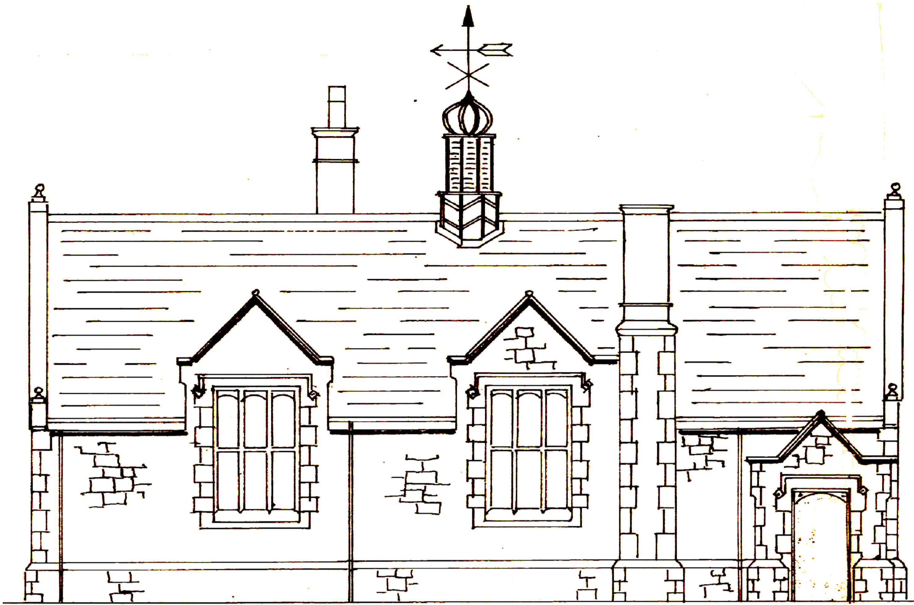
NORTH EAST ELEVATION (EXISTING AND PROPOSED)