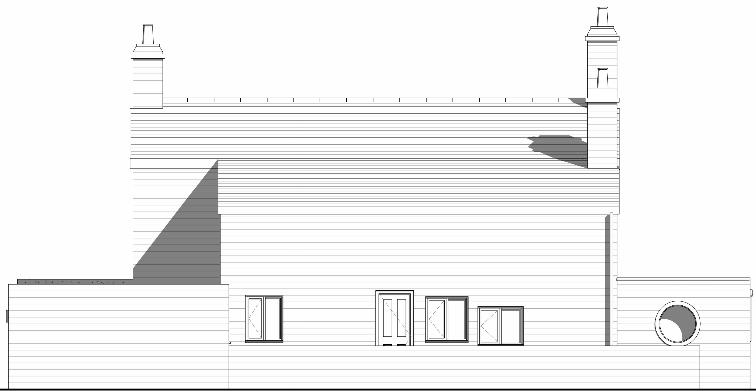
3. EXISTING REAR ELEVATION 1:50