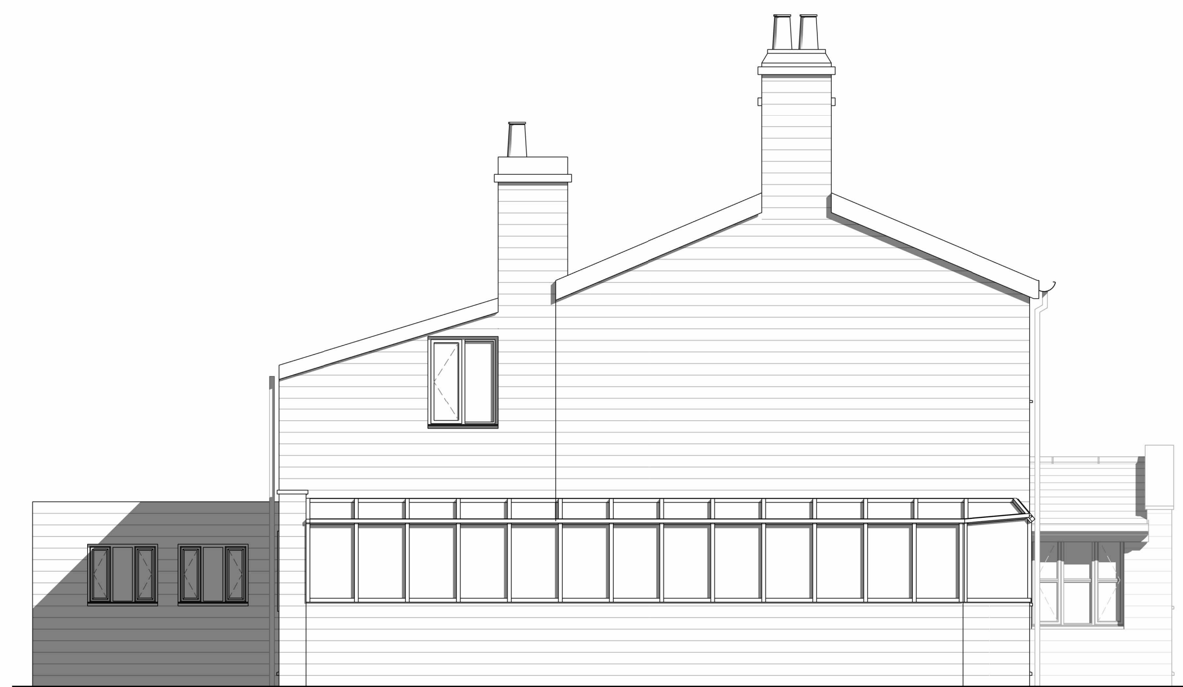
2. EXISTING SIDE ELEVATION 1:50