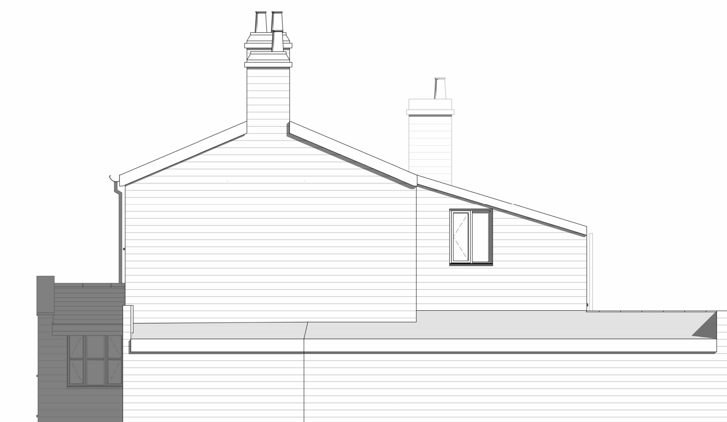
4. EXISTING SIDE ELEVATION 1:50