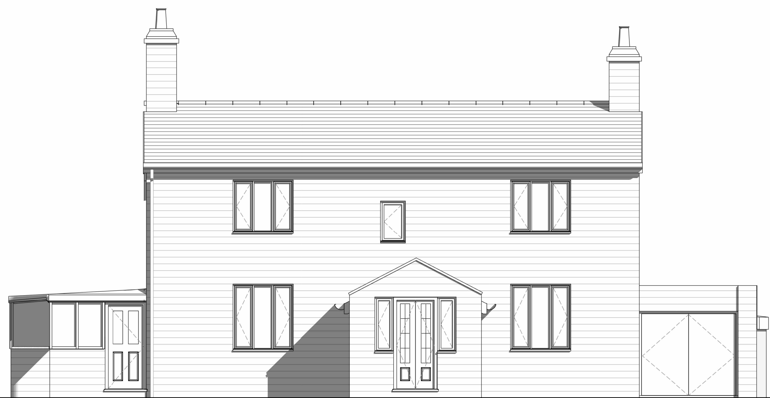
1. EXISTING FRONT ELEVATION 1:50