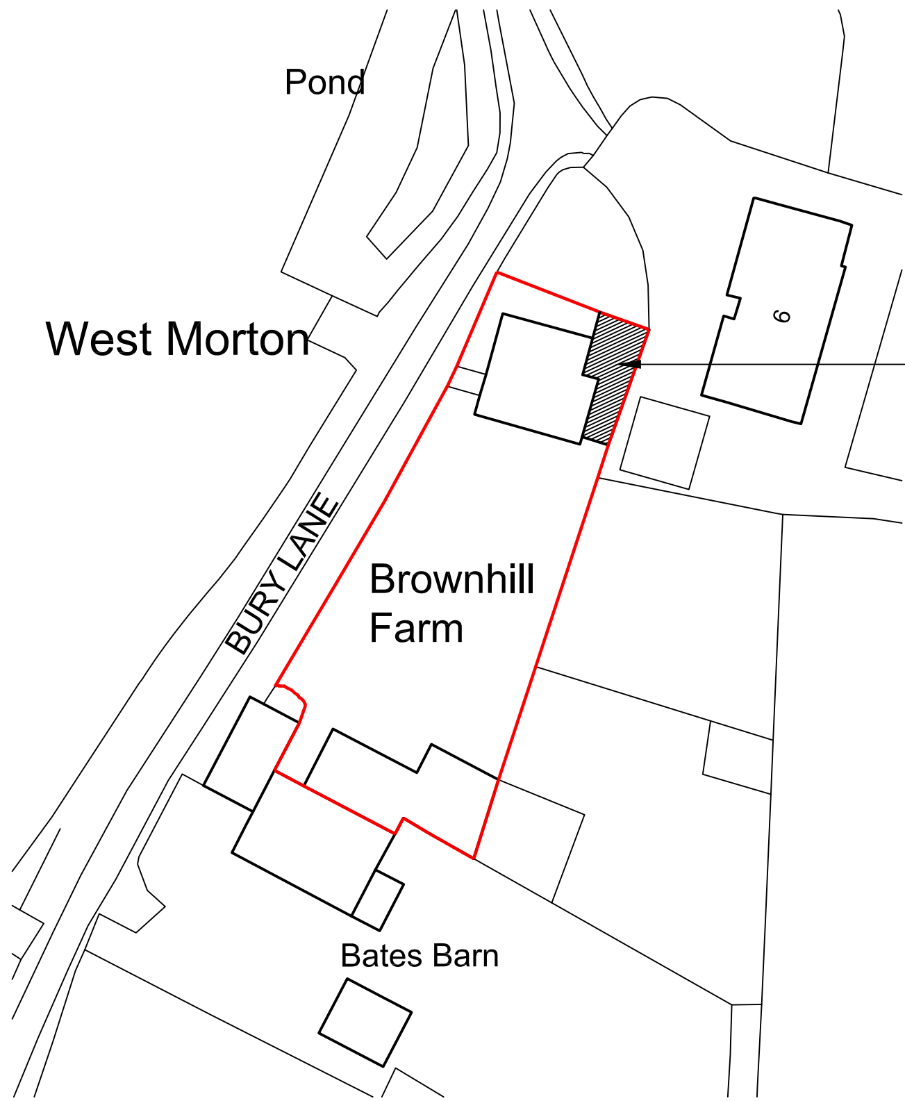
Proposed Site Block Plan

Shaded area denotes first floor extension to existing building