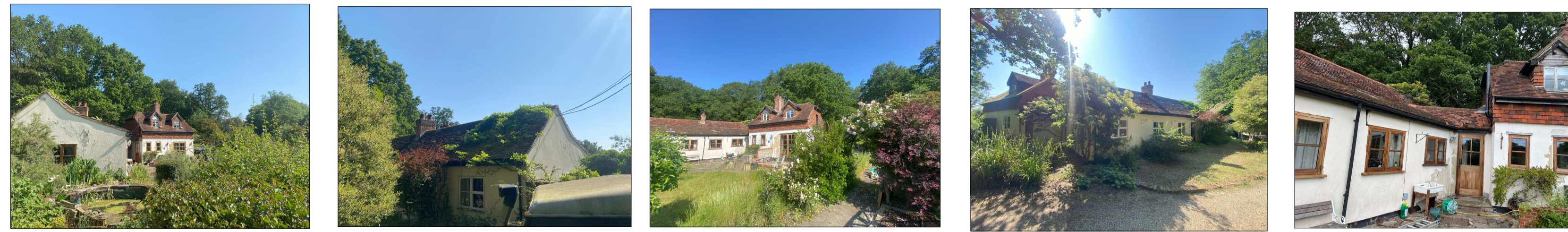
Existing Photographs Scale: 1:100