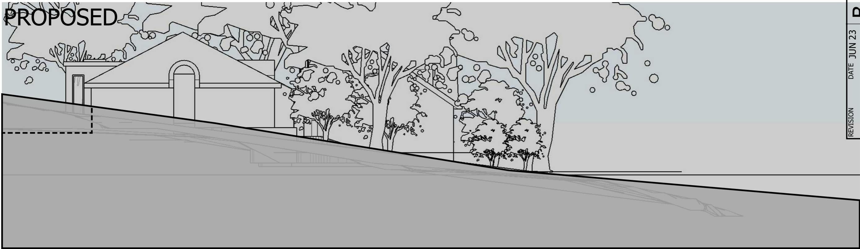
PROPOSED SIDE ELEVATION (SOUTH EAST)