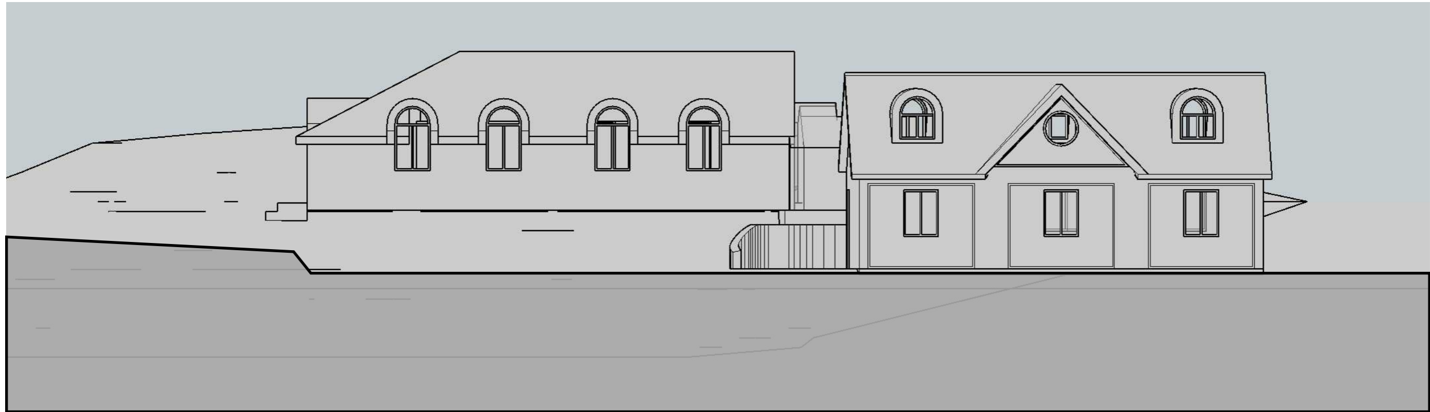
FRONT ELEVATION (NORTH EAST) WITH VIEW OBSTRUCTIONS REMOVED