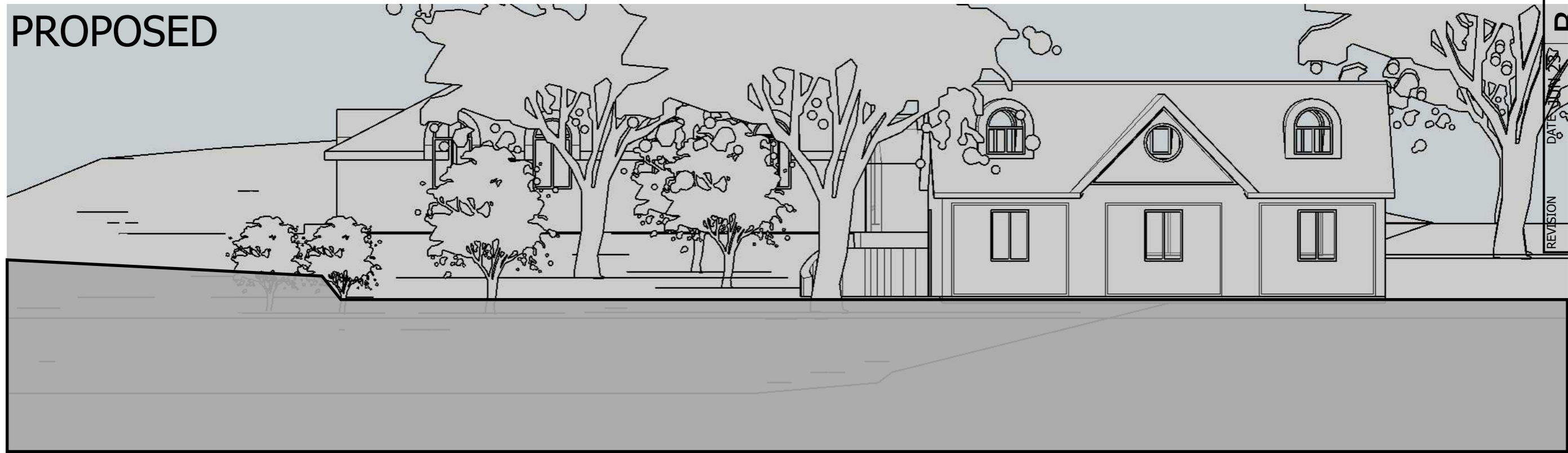
FRONT ELEVATION (NORTH EAST)