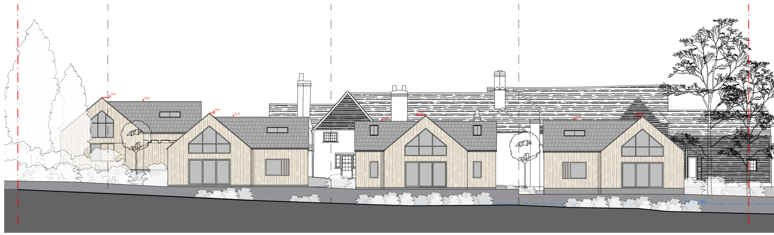
PROPOSED: SITE SECTION 1