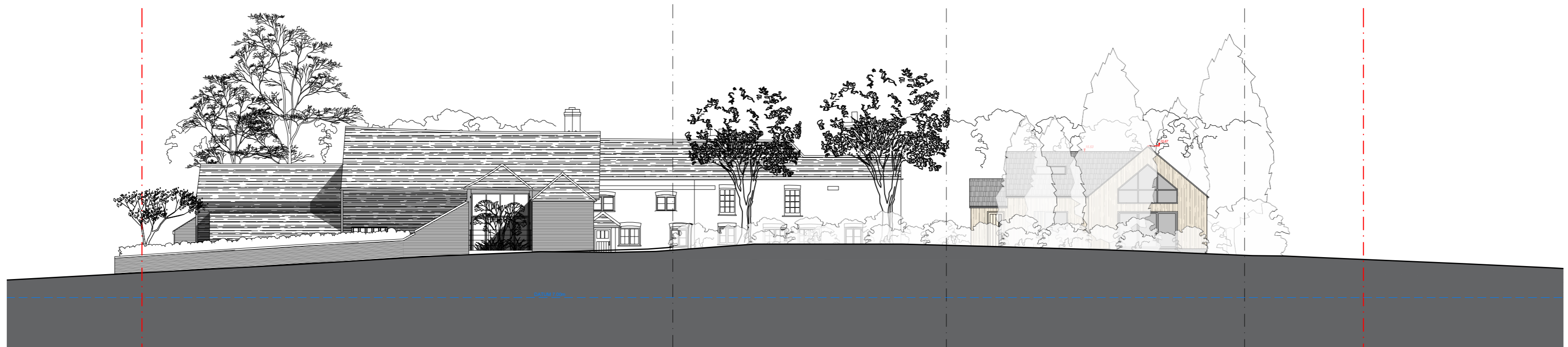
PROPOSED: SITE SECTION 5