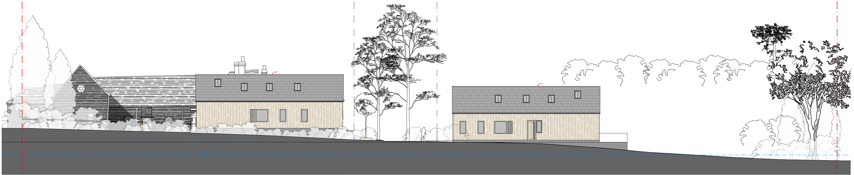
PROPOSED: SITE SECTION 2