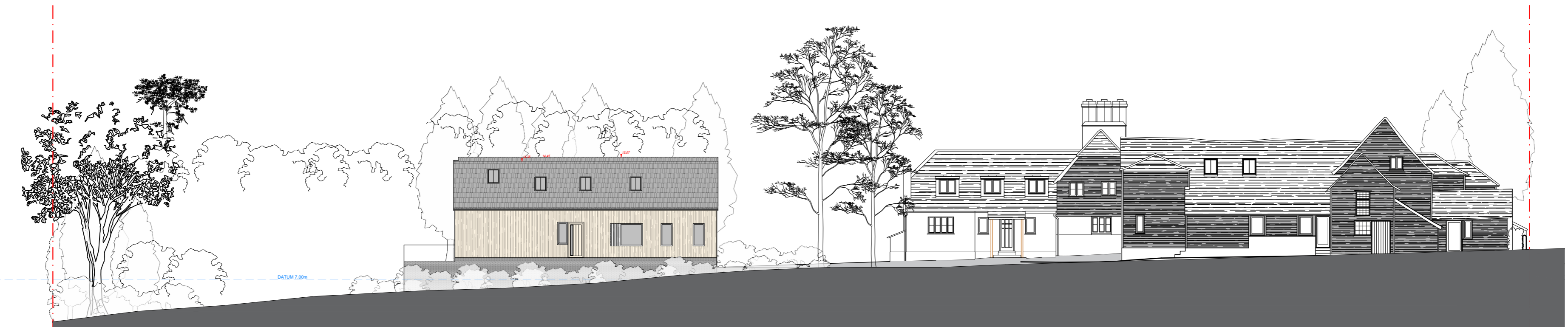
PROPOSED: SITE SECTION 4