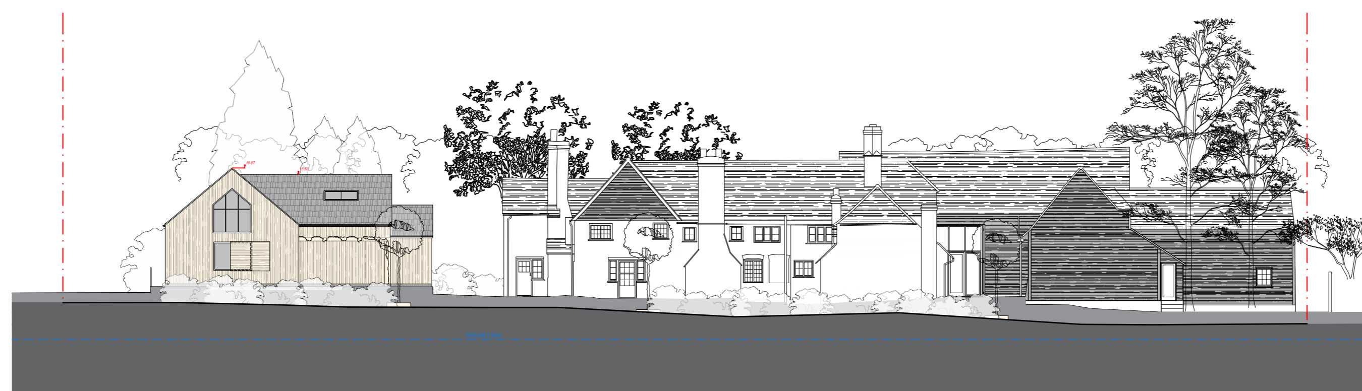
PROPOSED: SITE SECTION 7