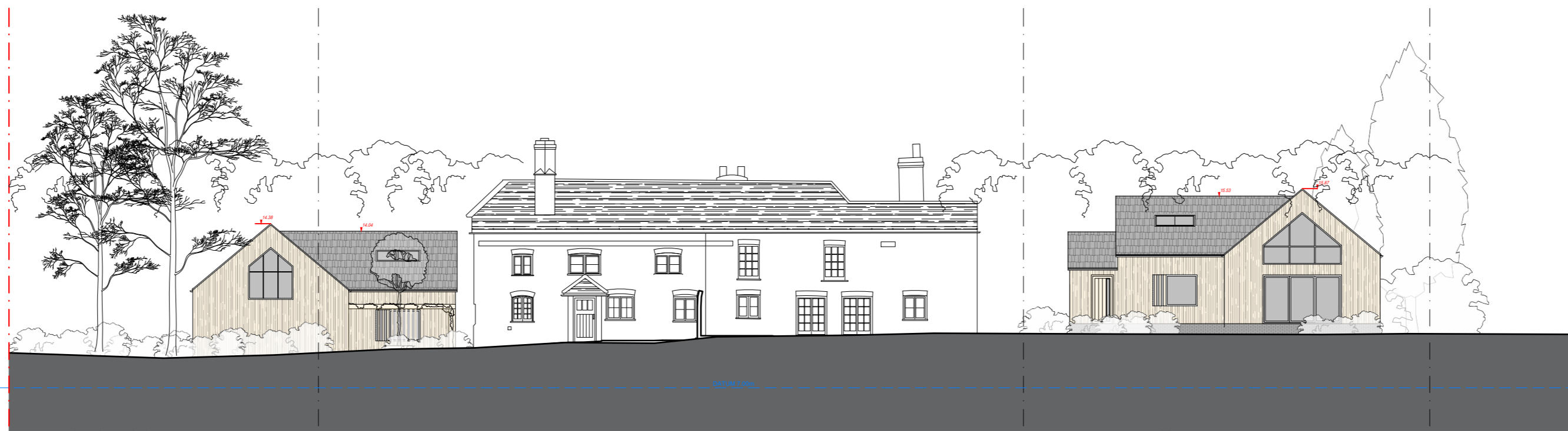
PROPOSED: SITE SECTION 3