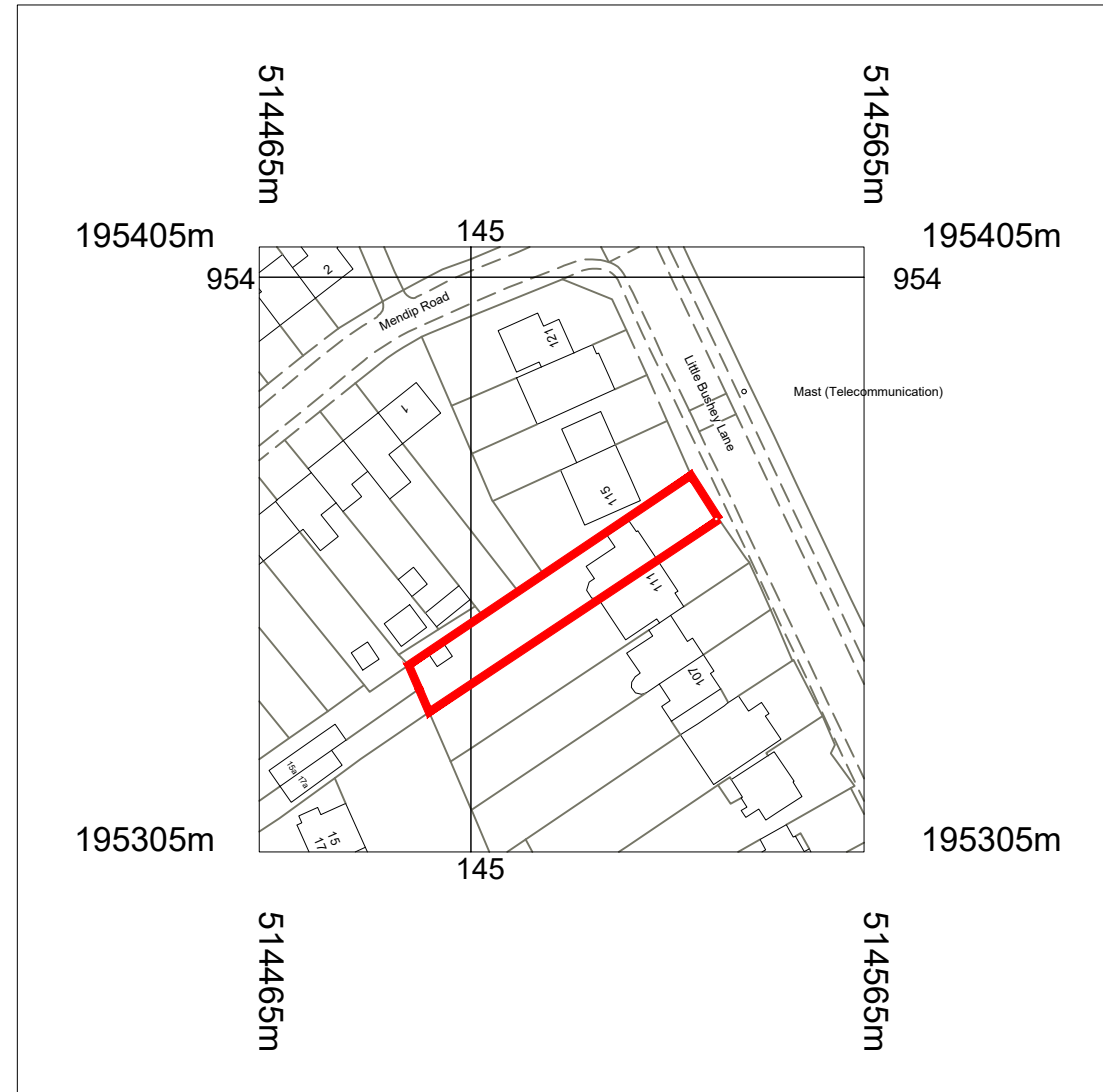
2 LOCATION PLAN - EXISTING Scale: 1:1250