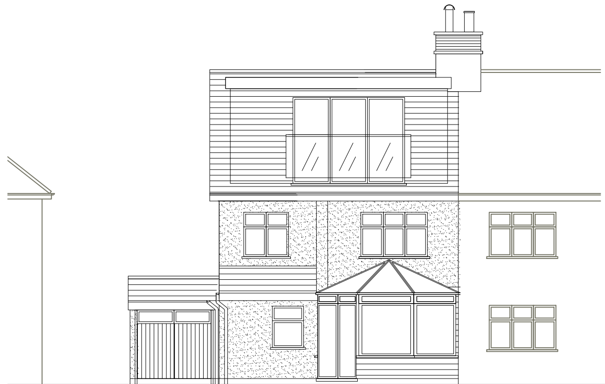
4 REAR ELEVATION - EXISTING Scale: 1:100