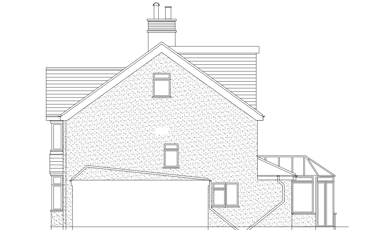
3 SIDE ELEVATION - EXISTING Scale: 1:100