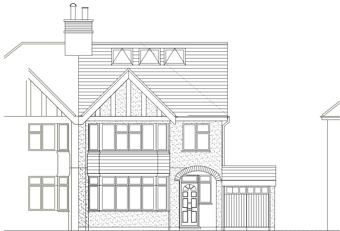
1 FRONT ELEVATION - EXISTING Scale: 1:100