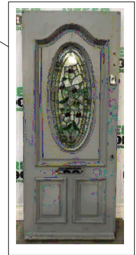
Replace front door door with a reclaimed original Victorian front door