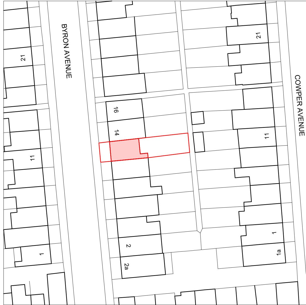
Existing Location Plan