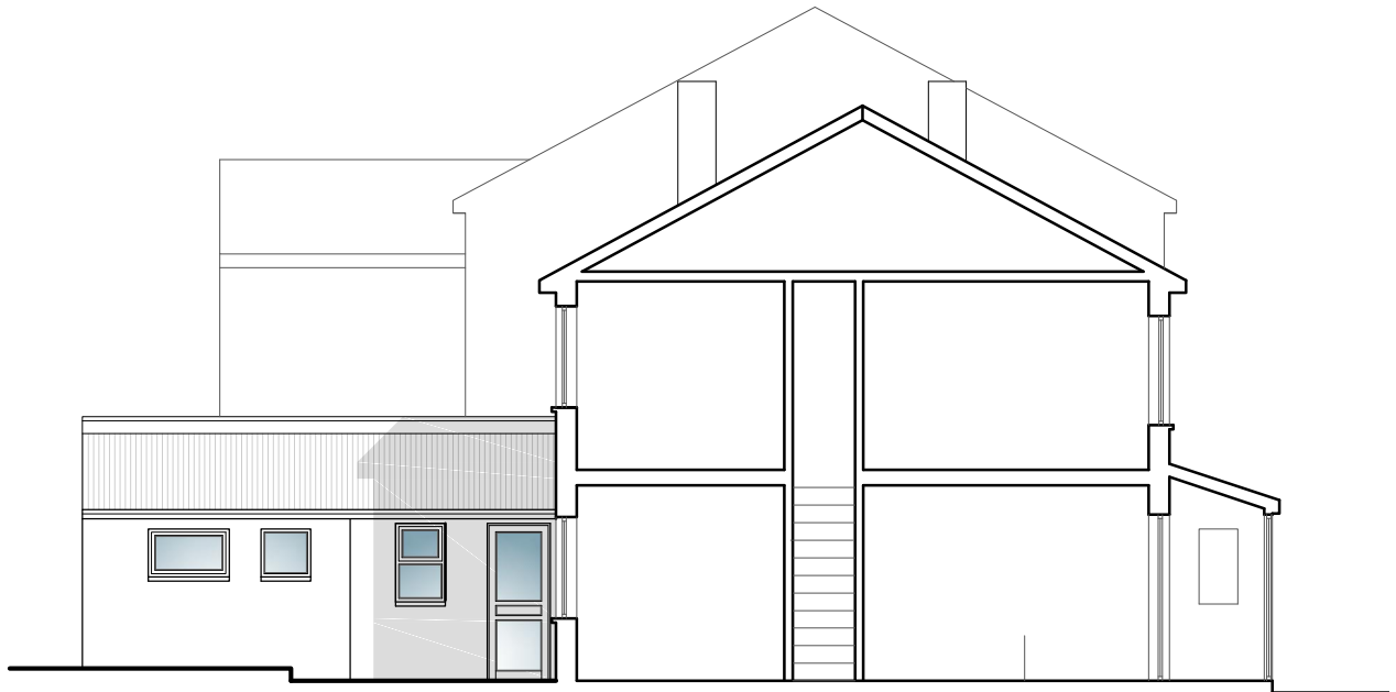
Existing Section. Scale 1:100