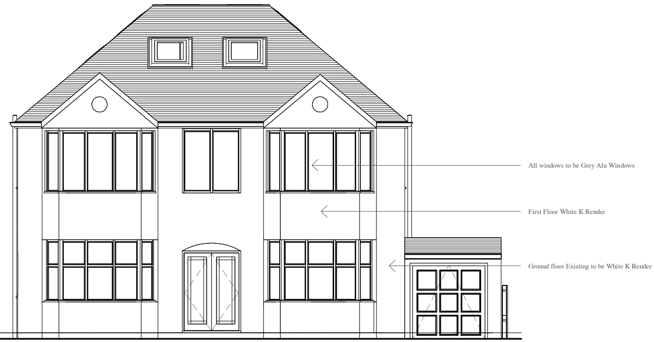
Proposed Front Elevation 1 : 100

ANY WORK COMMENCING BEFORE APPROVALS HAVE GRANTED IS AT THE RISK OF THE CLIENT AND THE BUILDER..