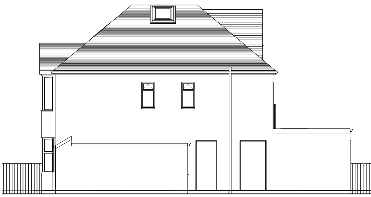
Proposed Side Elevation 1 : 100

Obscured Glazed windows to be provided to the Gable End, Fixed up to 1.7m from the finished floor level.