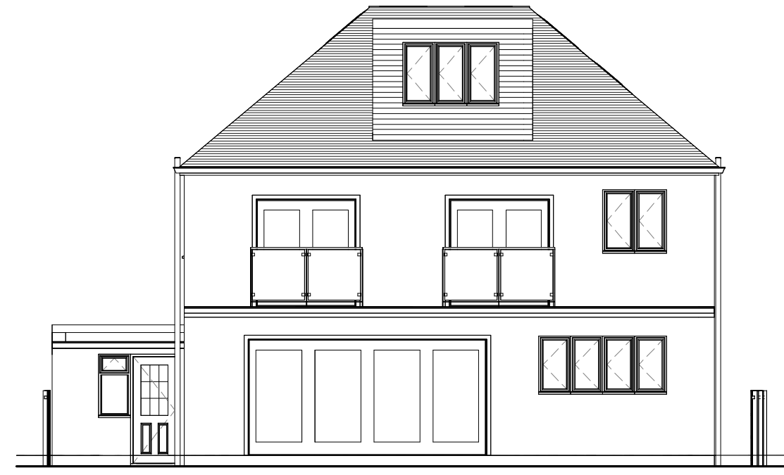
Proposed Rear Elevation 1 : 100