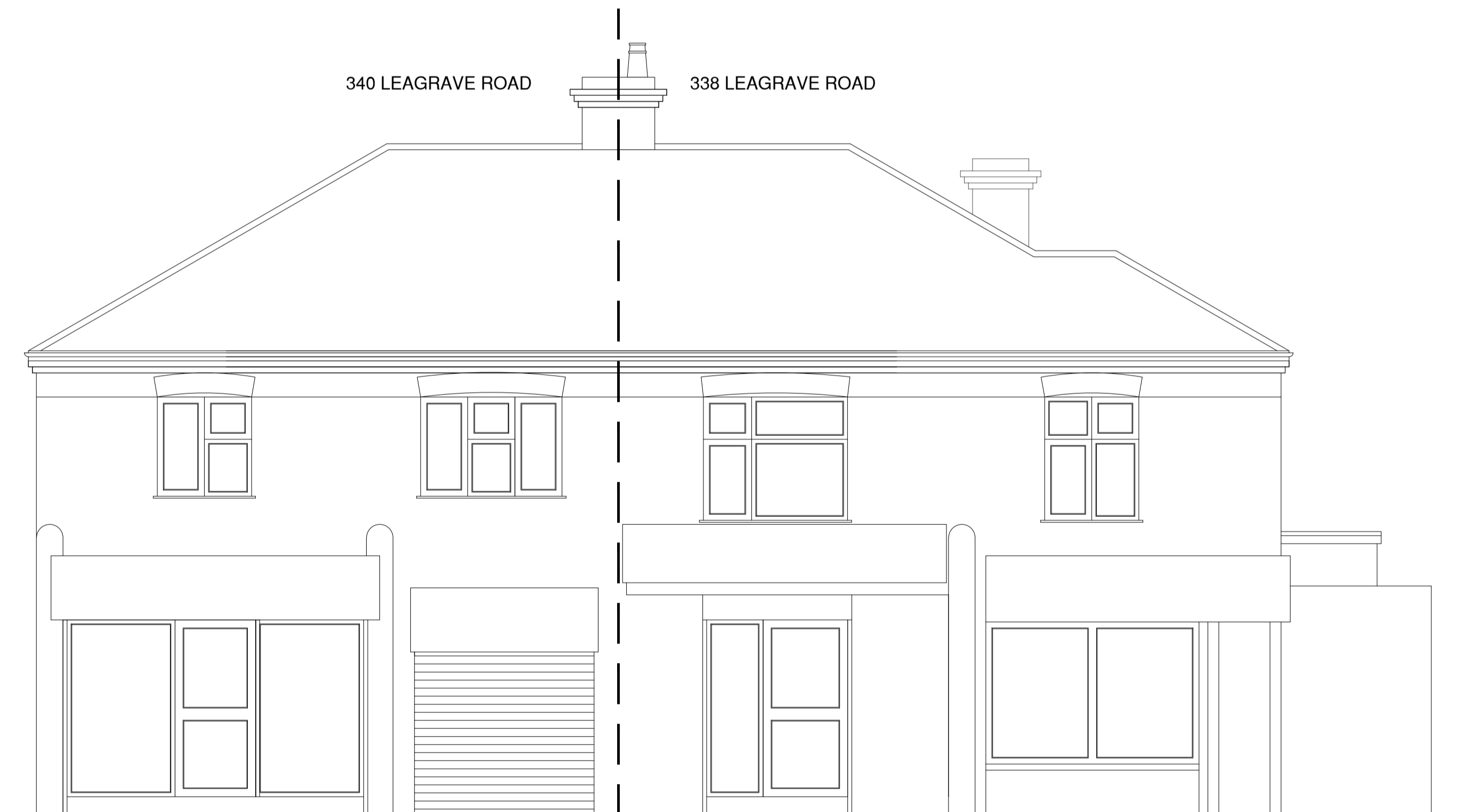
EXISTING FRONT ELEVATION & LEAGRAVE ROAD STREET SCENE