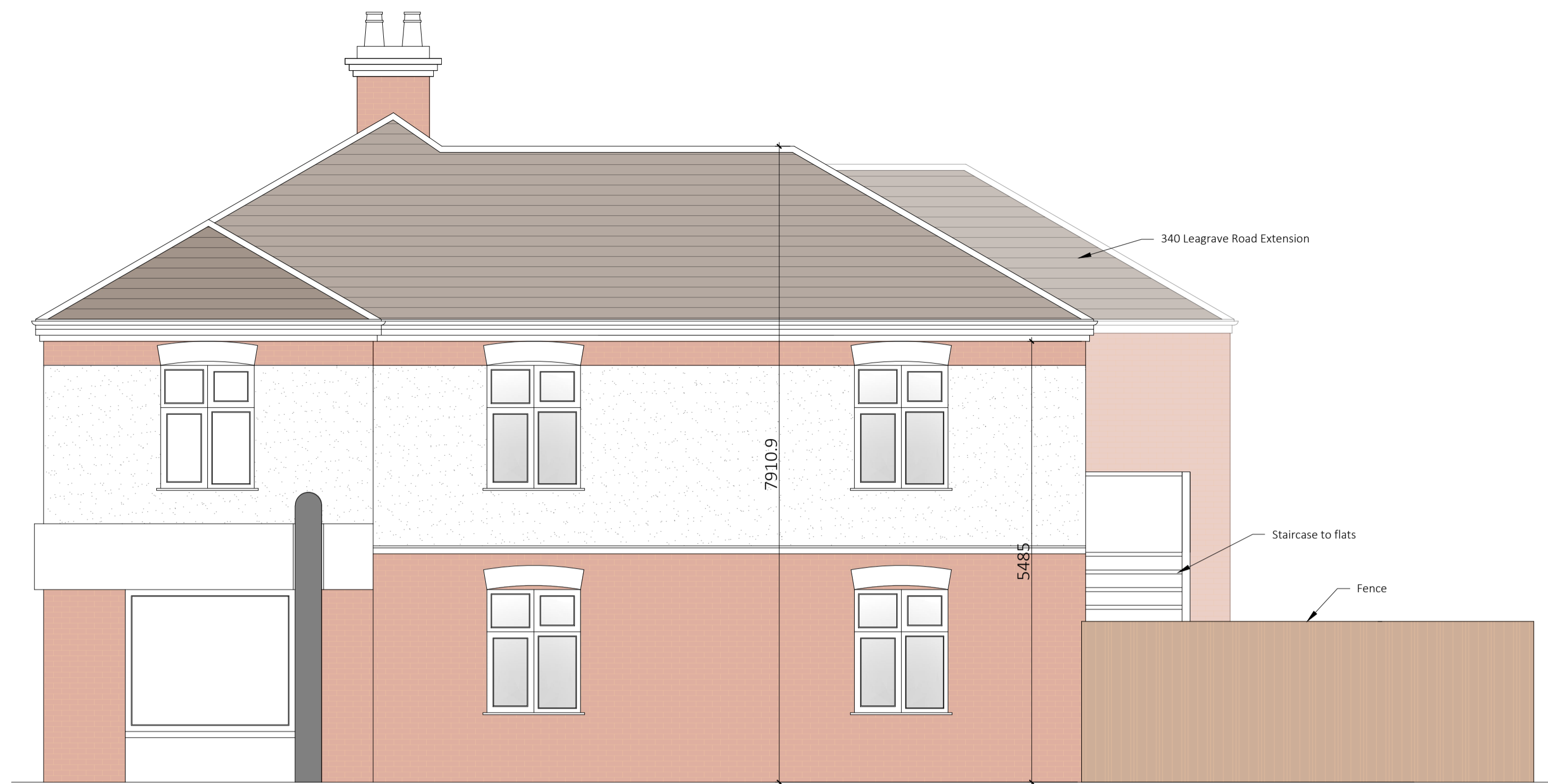
PROPOSED SIDE ELEVATION & TUDOR ROAD STREET SCENE