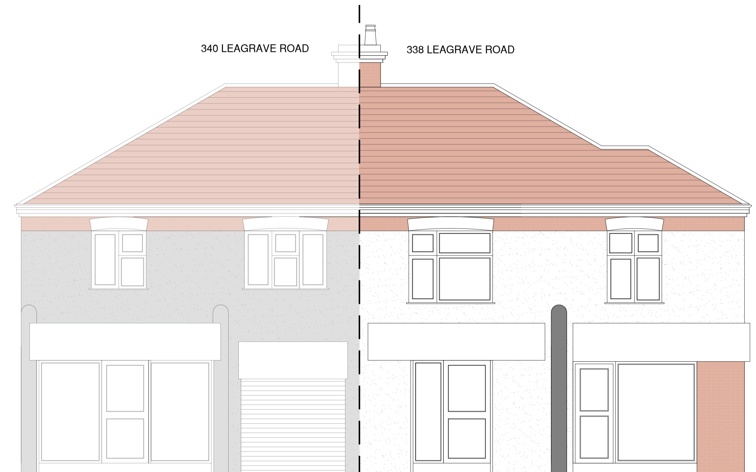
PROPOSED FRONT ELEVATION & LEAGRAVE ROAD STREET SCENE