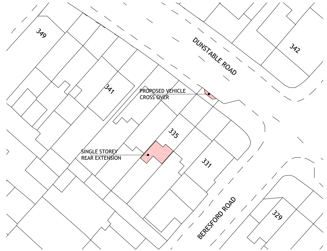
block plan scale 1:500