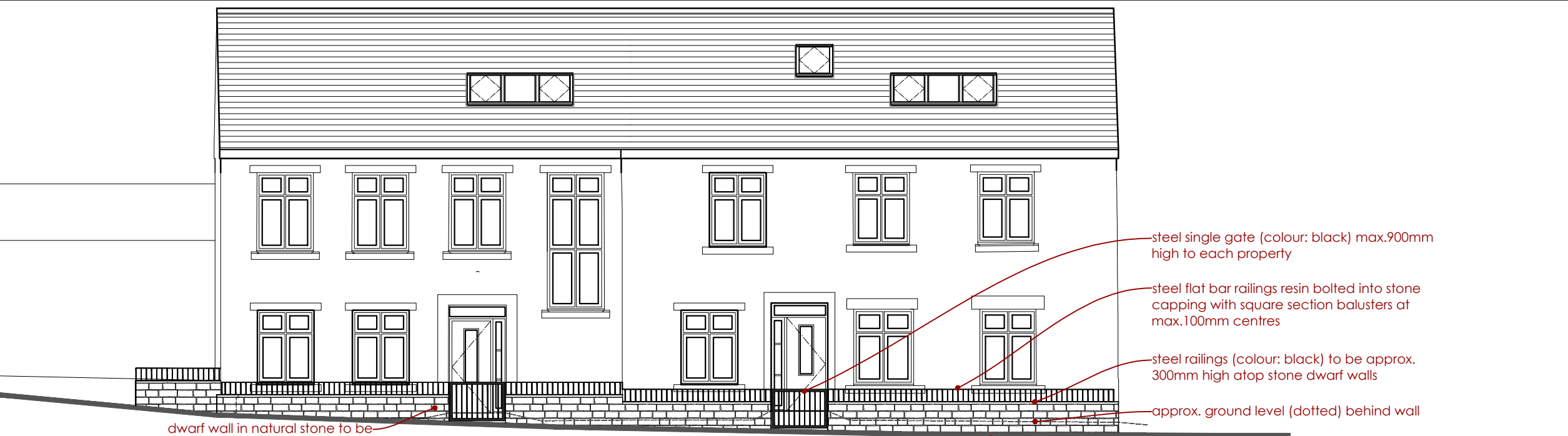
ELEVATION: ALONG HOLCOMBE ROAD