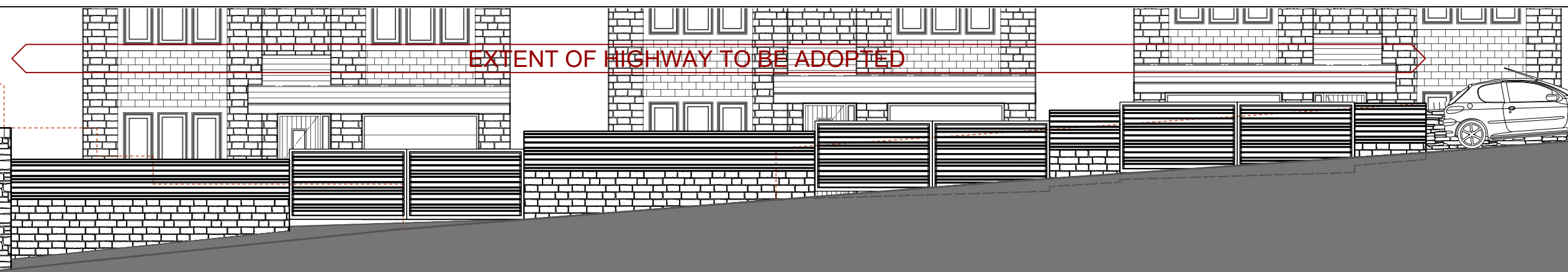
ELEVATION: ALONG ALDEN ROAD