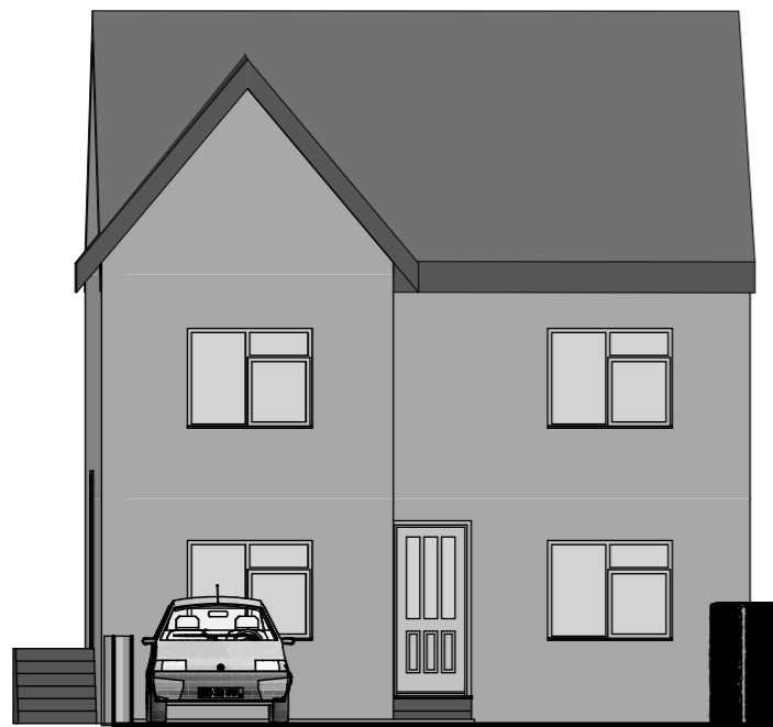
AS BUILT FRONT ELEVATION