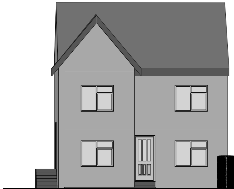
PRIOR TO BUILD FRONT ELEVATION