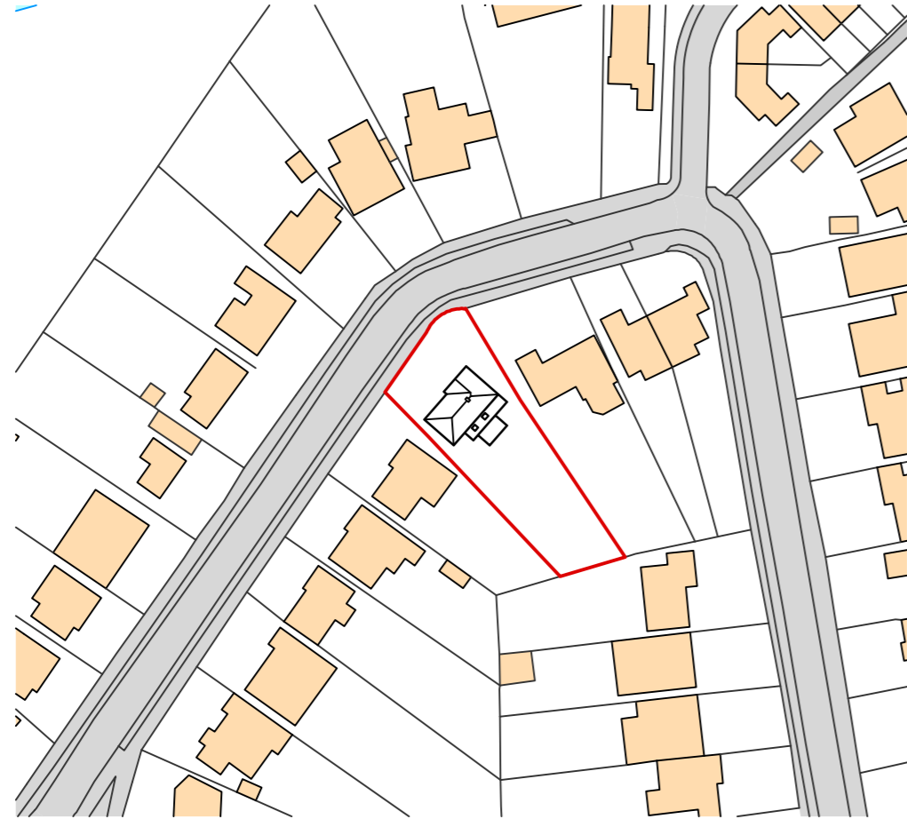
01 Existing Location Plan Scale: 1:1250