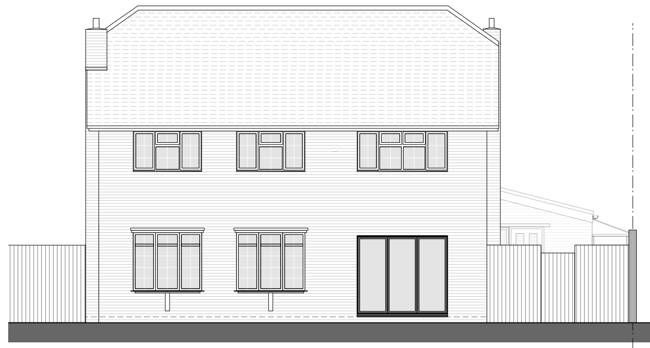
North Elevation (original rear elevation as permitted under planning permission SW/5/72/674A).